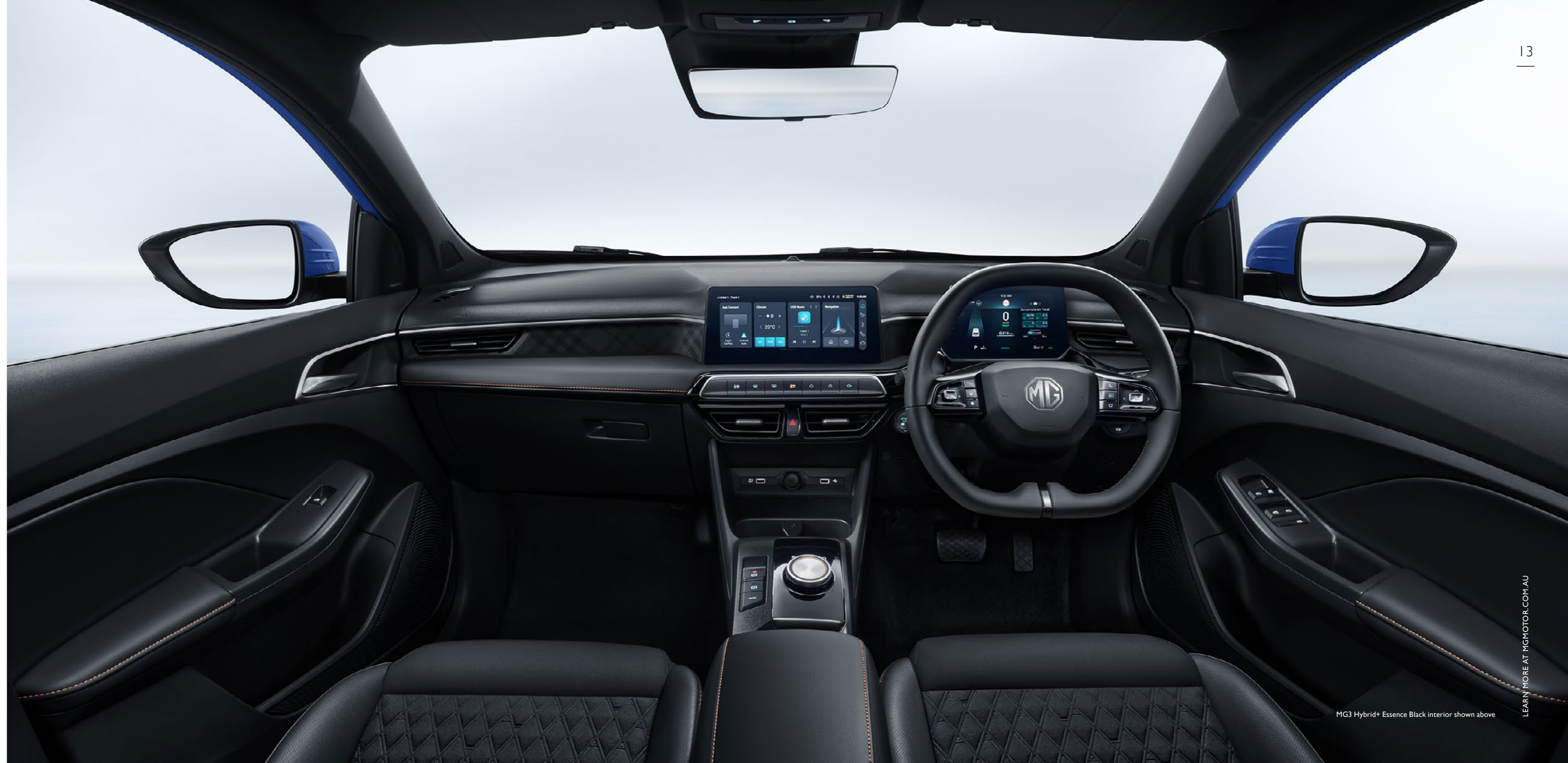
MG3 Hybrid+ Essence Black interior shown above