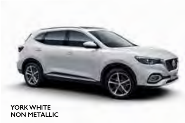
YORK WHITE NON METALLIC