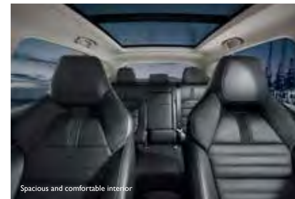
Spacious and comfortable interior