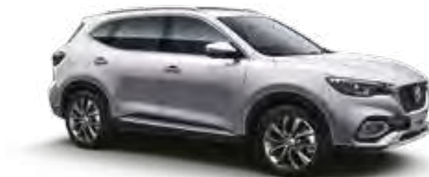
STERLING SILVER METALLIC