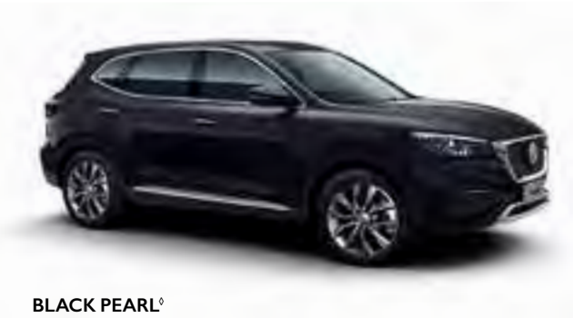
BLACK PEARL † METALLIC