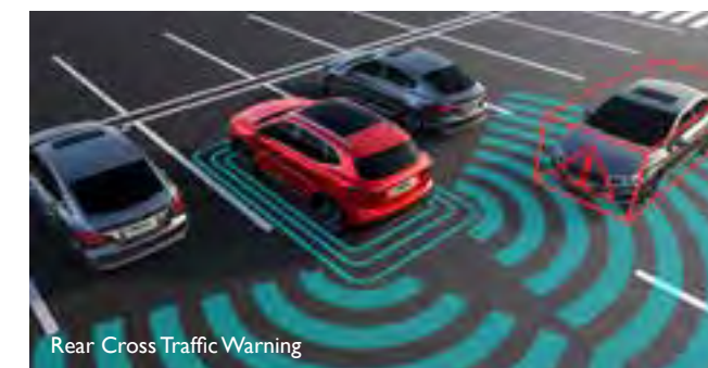
Rear Cross Traffic Warning