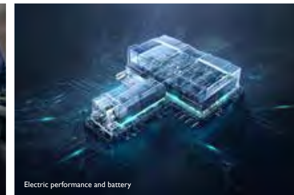
Electric performance and battery