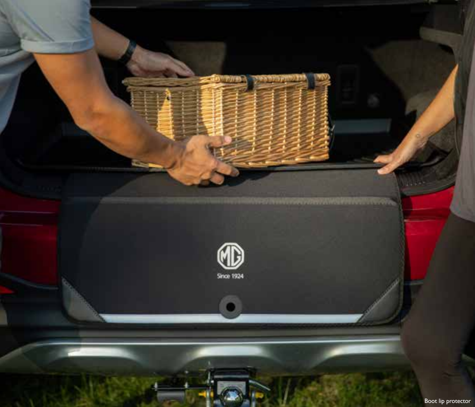
Boot lip protector