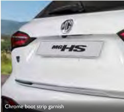
Chrome boot strip garnish