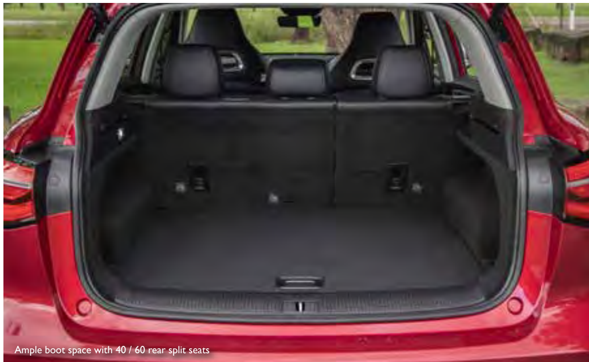
Ample boot space with 40 / 60 rear split seats

The powerful 2.0L Turbo engine is ideal for reactive driving in urban environments as well as navigating those longer rural road trips. In addition, the premium Michelin tyres are also adaptive to both city and country terrain, ensuring uncompromised performance on and off the beaten track.