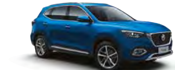
SURFING BLUE METALLIC