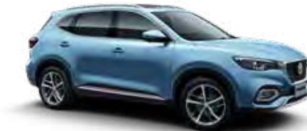
CLIPPER BLUE ‡ METALLIC