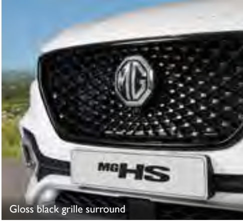
Gloss black grille surround