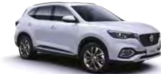
NEW PEARL WHITE METALLIC

Brighten your drive with our range of expressive MG HS colours. Choose from our considered selection of bespoke shades in both metallic and non-metallic options