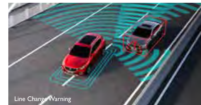
Line Change Warning