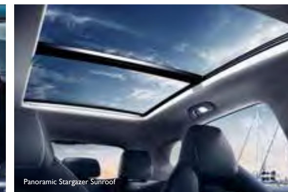
Panoramic Stargazer Sunroof

*Range figures are determined by testing under standardised laboratory conditions to comply with ADR 81 / 02. These figures should only be used for the purpose of comparison amongst vehicles. Actual figures will generally differ under real world driving conditions and will vary depending on factors including (but not limited to) driving style, vehicle's equipment and road, traffic and weather conditions. Provisional data at time of going to print. ^ Charging times can vary depending on many factors including but not limited to environmental conditions, auxiliary consumables (e.g. seat heating and air-conditioning) and capabilities of charging infrastructure capacity and/or supply ~Figures according to ADR 81/02 derived from laboratory testing. Factors including but not limited to driving style, road and traffic conditions, environmental influences, vehicle condition and accessories fitted, will in practice in the real world lead to figures which generally differ from those advertised. Advertised figures are meant for comparison amongst vehicles only. Actual Australian specification may vary from vehicle shown.