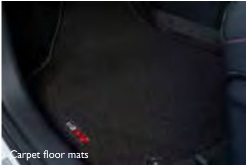
Carpet floor mats