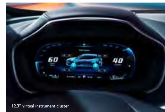
12.3" virtual instrument cluster