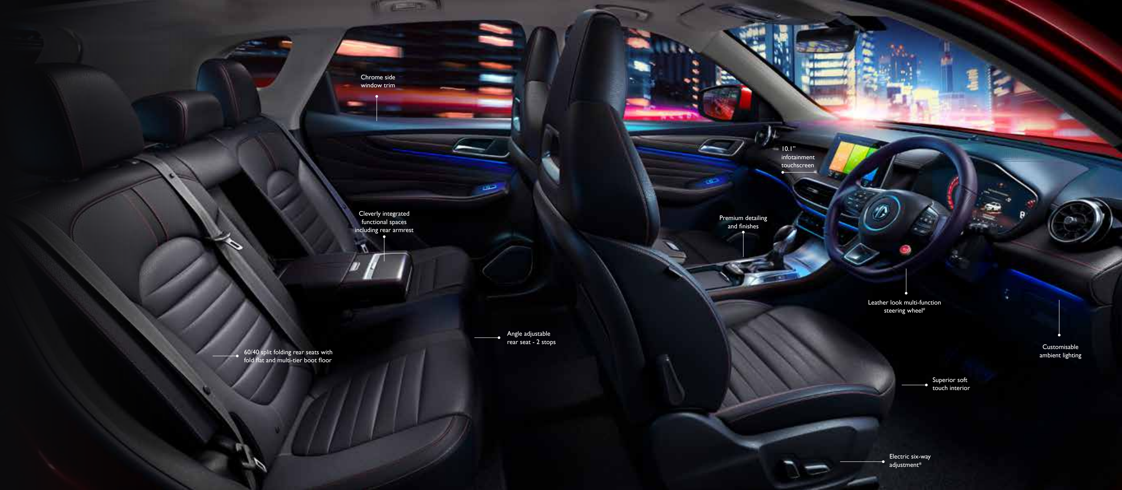
Chrome side window trim