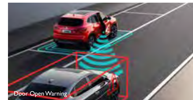
Door Open Warning