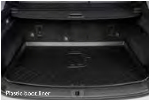
Plastic boot liner