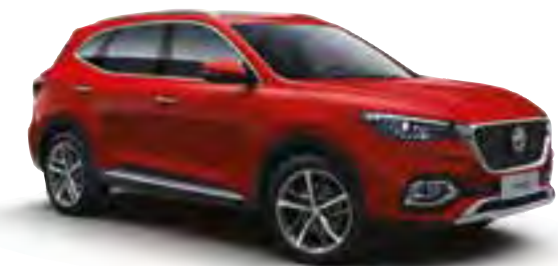
PHANTOM RED METALLIC