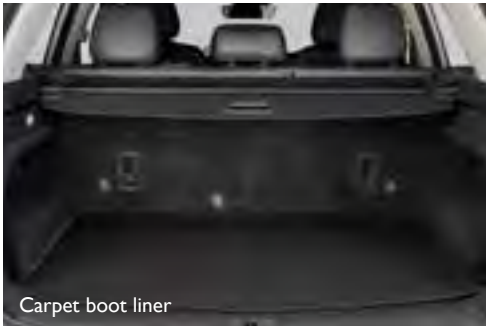
Carpet boot liner