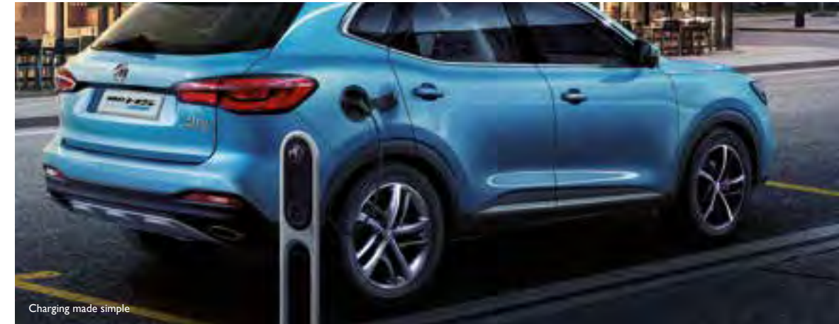
Charging made simple