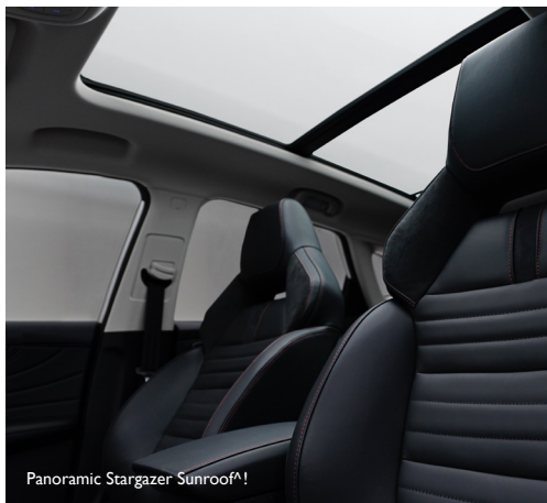
Panoramic Stargazer Sunroof ^1