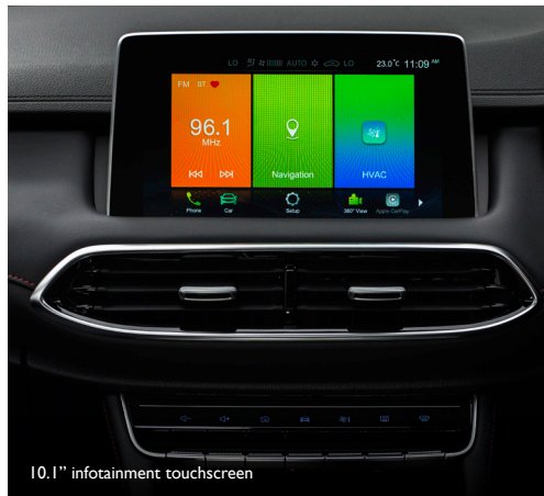
10.1" infotainment touchscreen