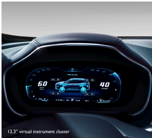
12.3" virtual instrument cluster