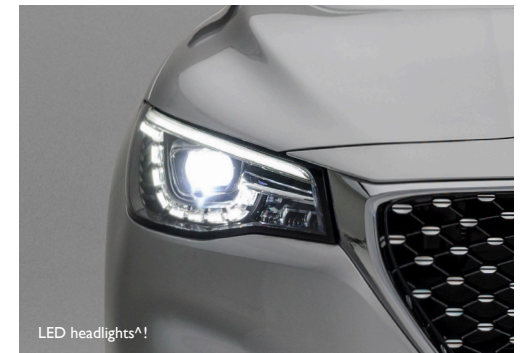
LED headlights ^!