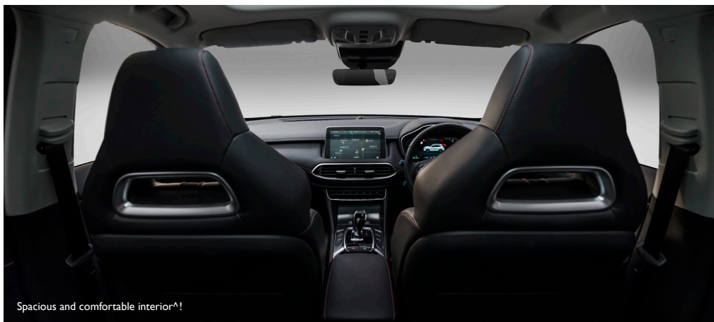
Spacious and comfortable interior ^1