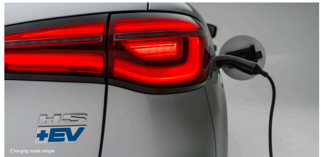
Charging made simple