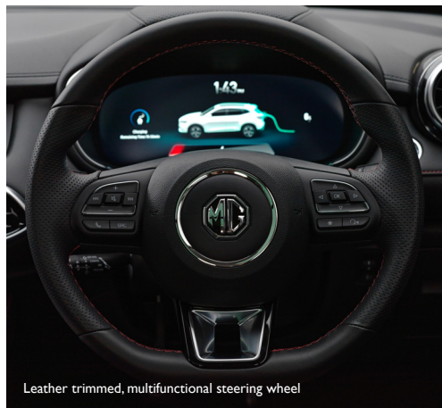
Leather trimmed, multifunctional steering wheel