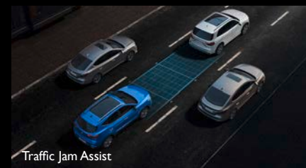
Traffic Jam Assist