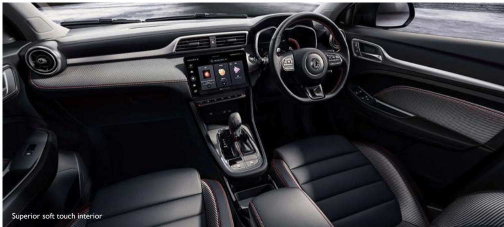
Superior soft touch interior