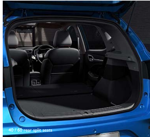
40 / 60 rear split seats