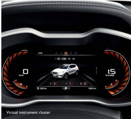
Virtual instrument cluster