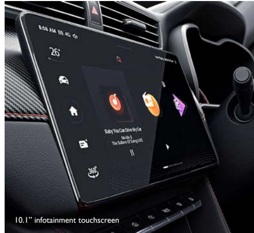
10.1" infotainment touchscreen