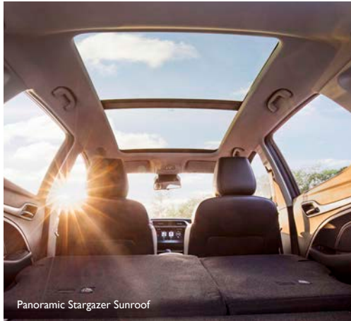
Panoramic Stargazer Sunroof