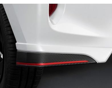
» REAR AIR DAM