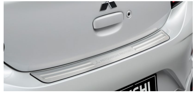
REAR BUMPER GUARDS