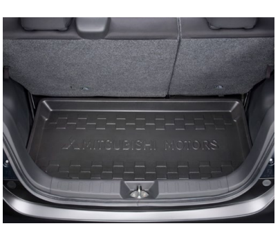
» LUGGAGE TRAY