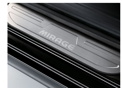
» SCUFF PLATE