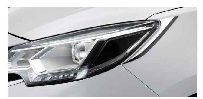
» HEADLAMP GARNISH