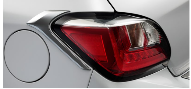
» REAR HEADLAMP GARNISH