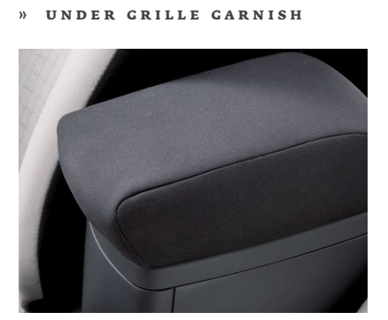
» ARMREST CONSOLE