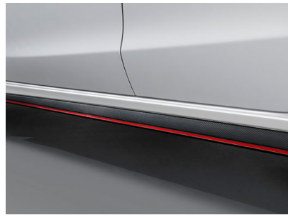
» SIDE AIR DAM