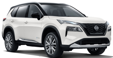
Ivory Pearl with black roof #~