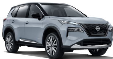
Ceramic Grey with black roof #~