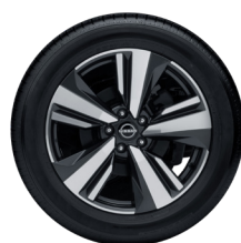
19" alloy wheel Standard on Ti grades Standard on Ti-L 2.5L Optional on Ti-L e-POWER