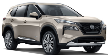
Champagne Silver #