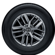
17" alloy wheel Standard on ST grades