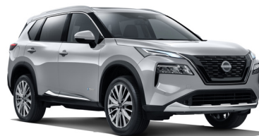
Brilliant Silver #