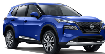
Caspian Blue #