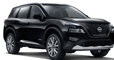
Diamond Black #