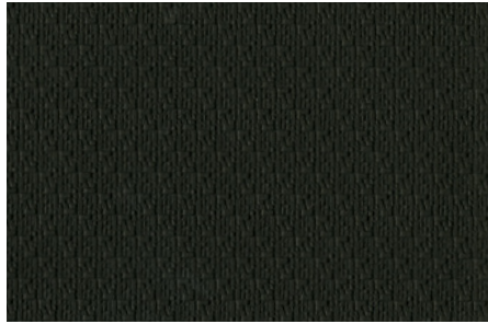
Black synthetic leather seat trim. Available on ST-L & N-TREK