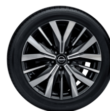
20" alloy wheel Standard on Ti-L e-POWER