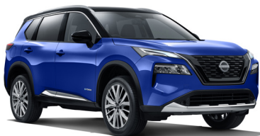
Caspian Blue with black roof #~