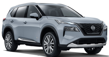
Ceramic Grey #