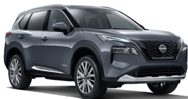
Gun Metallic #