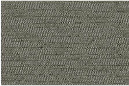
Light charcoal seat trim. Available on ST.