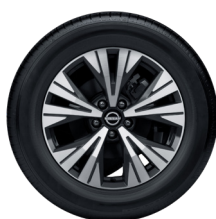
18" alloy wheel Standard on ST-L grades