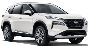
Ivory Pearl #