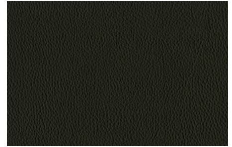
Black genuine leather-accented* seat trim. Available on Ti.