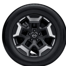
18" N-TREK alloy wheel Standard on N-TREK