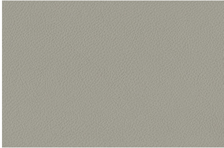
Light grey genuine leather-accented* seat trim. Available on Ti.