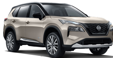
Champagne Silver with black roof #~