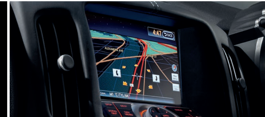
HDD SATELLITE NAVIGATION WITH 3D MAPPING