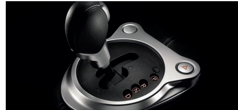
OPTIONAL AUTOMATIC TRANSMISSION