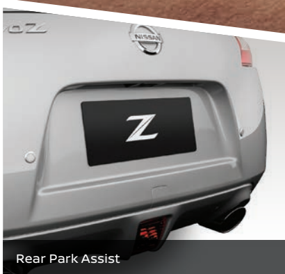
Rear Park Assist