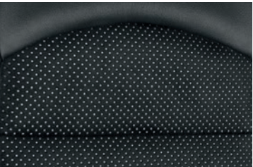
Coupe seat trim: Sports black leather accented^ trim with non-slip cloth insert.

In some cases, the printed colours may vary from the actual paint colours. #Premium paint available at extra cost.