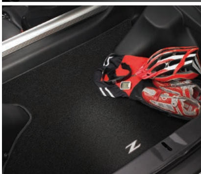
Rear Protection Carpet Mat