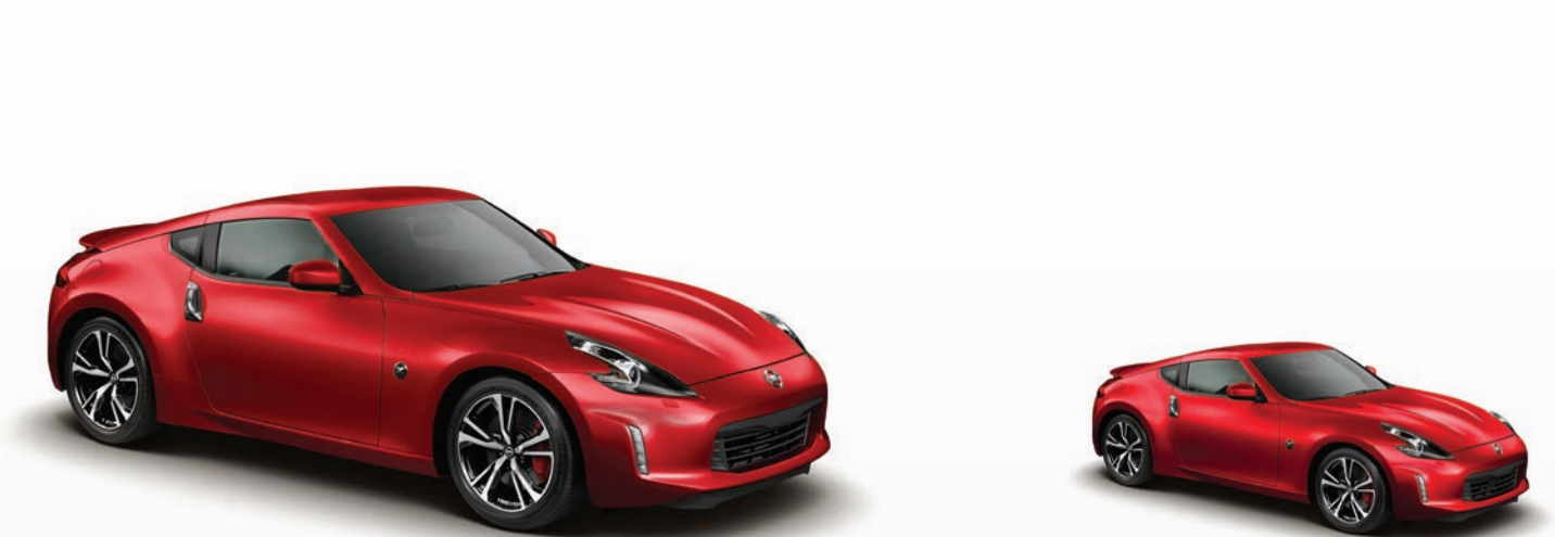
Eau Rouge Red