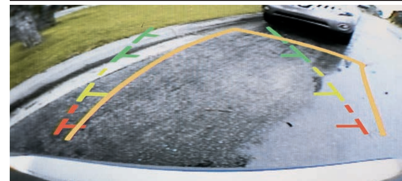
REAR VIEW CAMERA WITH PREDICTIVE PATH TECHNOLOGY