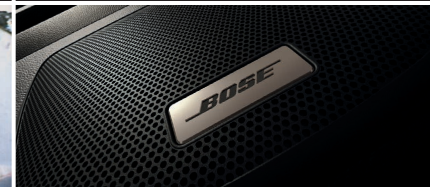
8 SPEAKER BOSE® AUDIO SYSTEM INCLUDING 2 SUBWOOFERS