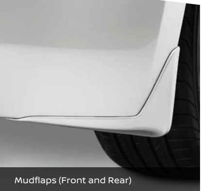
Mudflaps (Front and Rear)