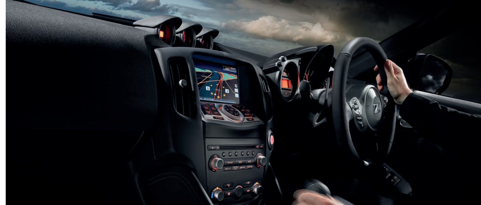
NISSAN 370Z INTERIOR

^ Leather accented features and upholstery may contain synthetic material. *iPod is a registered trademark of Apple Inc.