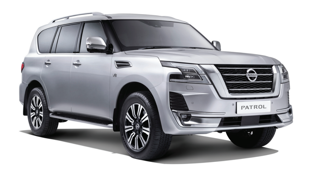
Brilliant Silver (K23)*