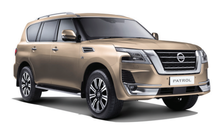
Champagne Quartz (HAG)™