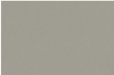
Light grey genuine leather-accented* seat trim. Available on Ti.