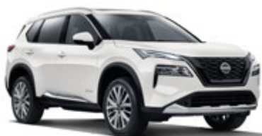
Ivory Pearl #