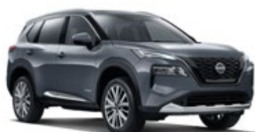
Gun Metallic #