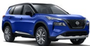
Caspian Blue with black roof #~