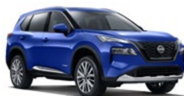
Caspian Blue #