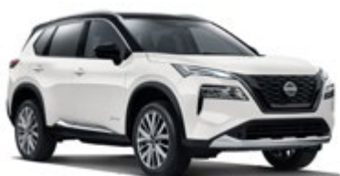
Ivory Pearl with black roof #~