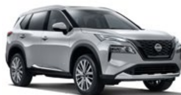
Brilliant Silver #