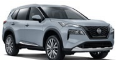
Ceramic Grey #