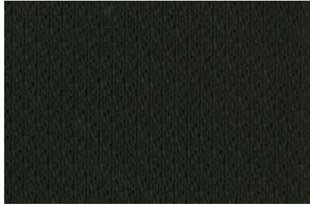
Black synthetic leather seat trim. Available on ST-L.