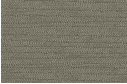
Light charcoal seat trim. Available on ST.