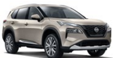
Champagne Silver #