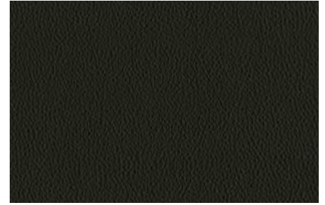
Black genuine leather-accented* seat trim. Available on Ti.