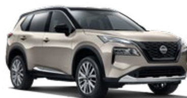
Champagne Silver with black roof #~