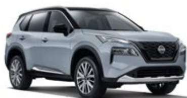
Ceramic Grey with black roof #~