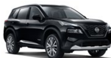
Diamond Black #