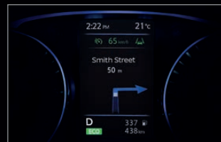
TURN-BY-TURN NAVIGATION. EXCLUDES ST