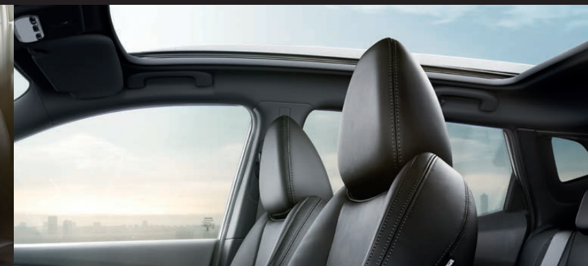
PANORAMIC GLASS ROOF