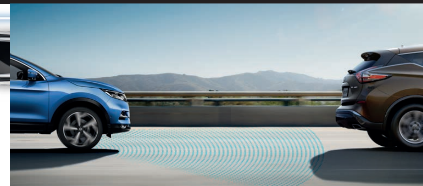
INTELLIGENT CRUISE CONTROL ‡