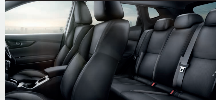
CLOTH SEAT TRIM