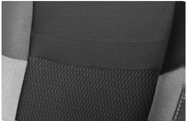
Cloth seat trim. Available on ST & ST+ only

In some cases, the printed colours may vary from the actual paint colours. #Premium paint available at extra cost.