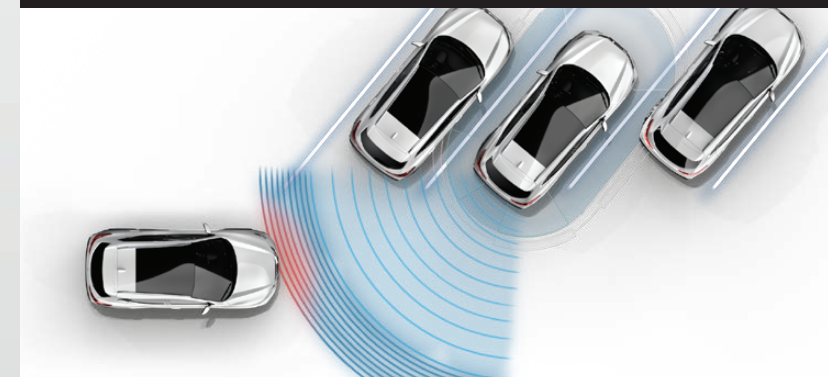
REAR CROSS TRAFFIC ALERT