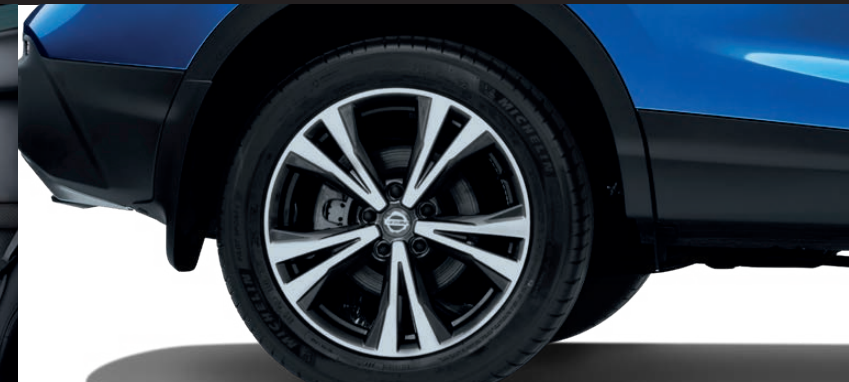
18" TWO-TONE ALLOY WHEELS