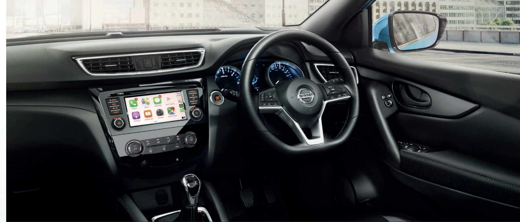
ST+ INTERIOR SHOWN*

^CarPlay is a registered trademark of Apple Inc. Android Auto is a trademark of Google LMC. Compatible device and USB connection required.