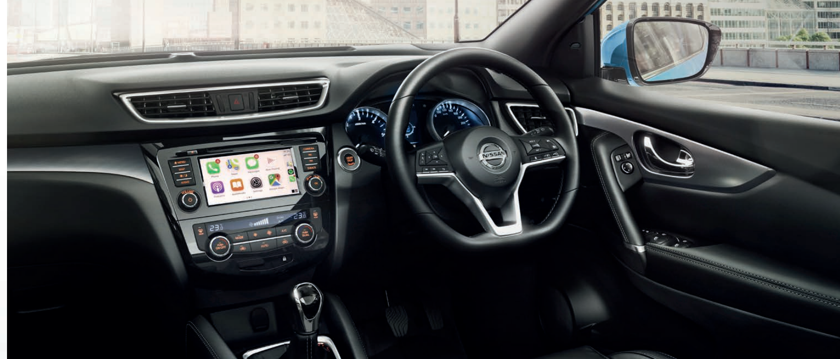
TI INTERIOR SHOWN*

Minor trim variations can occur from time to time. *Leather accented features and upholstery may contain synthetic material. †Driver's aid only and should not be used as a substitute for safe driving practices. Always monitor your surroundings when driving. ‡Intelligent Cruise Control is a driver's aid only and should not be used as a substitute for safe driving practices. Always monitor your surroundings when driving. Intelligent Cruise Control should not be used while towing. ^CarPlay is a registered trademark of Apple Inc. Android Auto is a trademark of Google LMC. Compatible device and USB connection required.