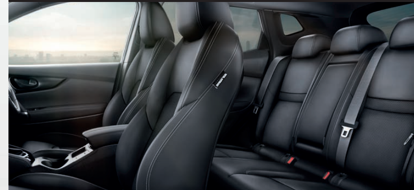
PART CLOTH/PART LEATHER-ACCENTED* SEAT TRIM