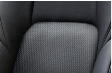
Part cloth/part leather-accented* seat trim. Available on ST-L only.