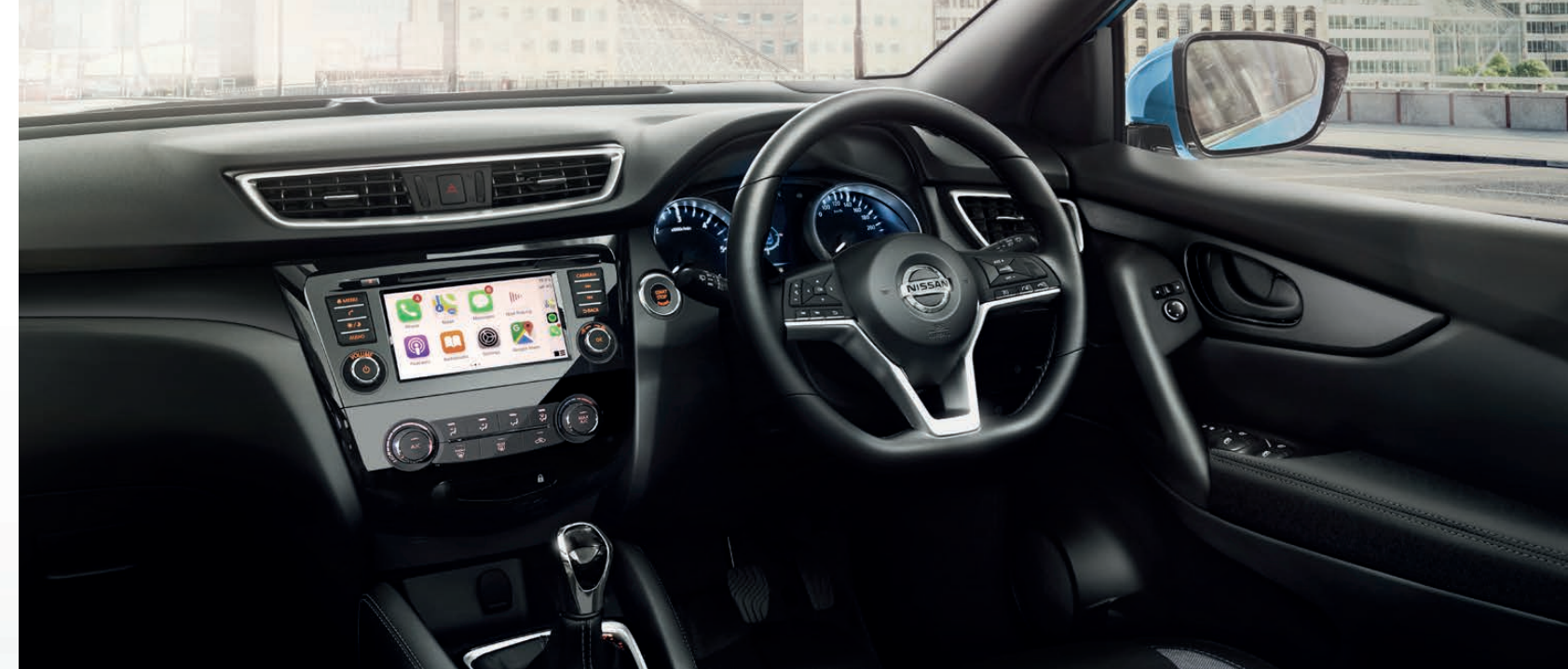
ST INTERIOR SHOWN*

*Leather accented features and upholstery may contain synthetic material. †Driver's aid only and should not be used as a substitute for safe driving practices. Always monitor your surroundings when driving. ^CarPlay is a registered trademark of Apple Inc. Android Auto is a trademark of Google LMC. Compatible device and USB connection required.