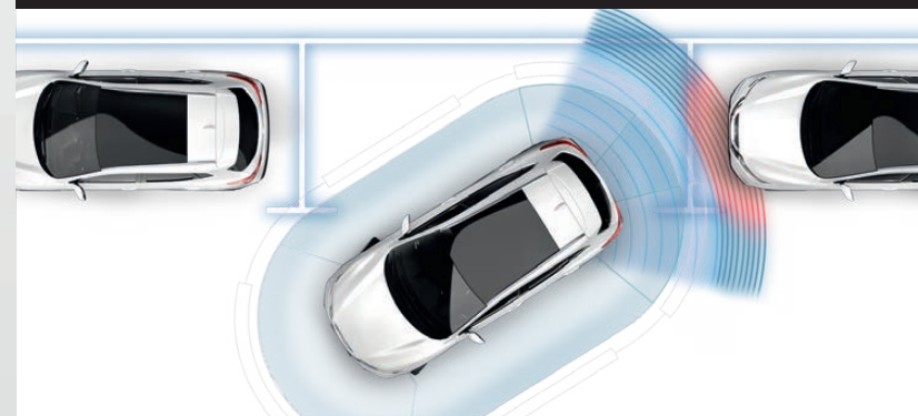
INTELLIGENT PARK ASSIST