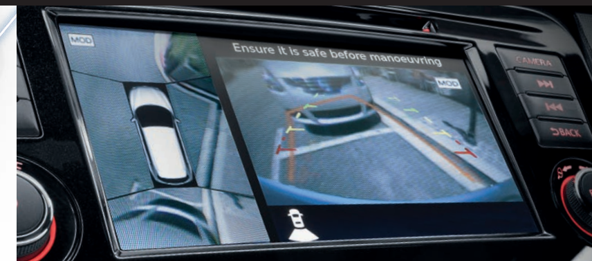
INTELLIGENT AROUND VIEW® MONITOR