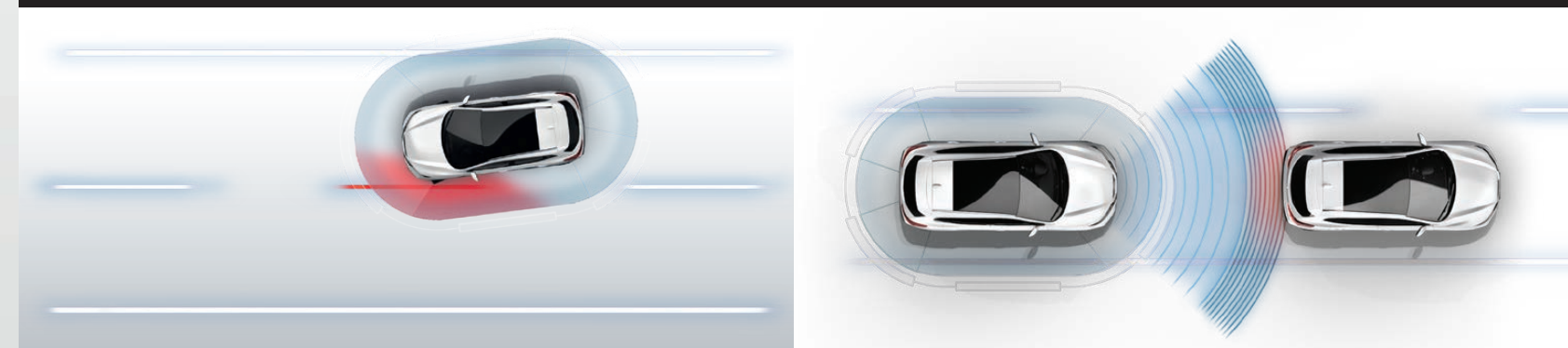
LANE DEPARTURE WARNING