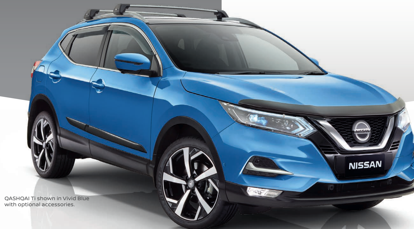
QASHQAI Ti shown in Vivid Blue with optional accessories.

Customise your Nissan QASHQAI to perfectly suit your lifestyle with the wide range of Nissan Genuine Accessories. From stylish Kick Plates to Black Alloy Wheels, each accessory has been designed to complement the looks of your Nissan QASHQAI. So hit the road in style with Nissan Genuine Accessories.