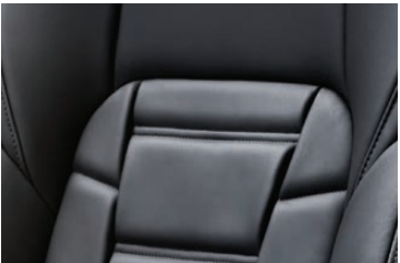
Premium quilted Nappa leather-accented* seat trim. Available on Ti only.

Minor trim variations may occur from time to time. +Leather accented features and upholstery may contain synthetic material.