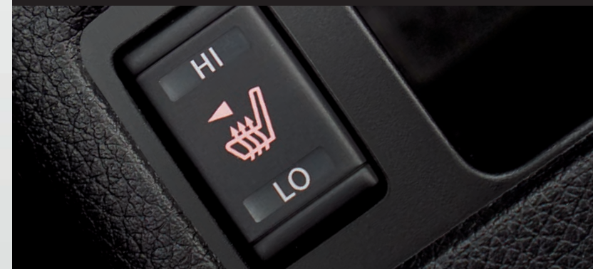
HEATED FRONT SEATS