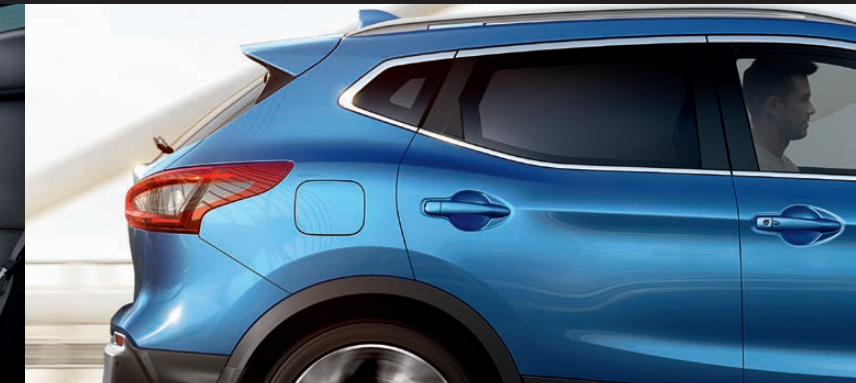
PRIVACY GLASS (2ND ROW AND REAR)