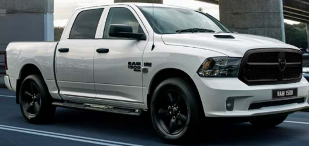
Express Crew cab with RamBox® shown.

More and more, Ram Trucks are redefining the conventional thinking behind the full-size pickup. This is capability based on brawn, technology based on brains, and the smart extra touches that make Ram Trucks shine. Ram 1500 Express® at a glance: Superb powertrain choices. Super-capable towing and hauling. Breakthrough suspension technology. Impressive connectivity. Comfortable interiors.