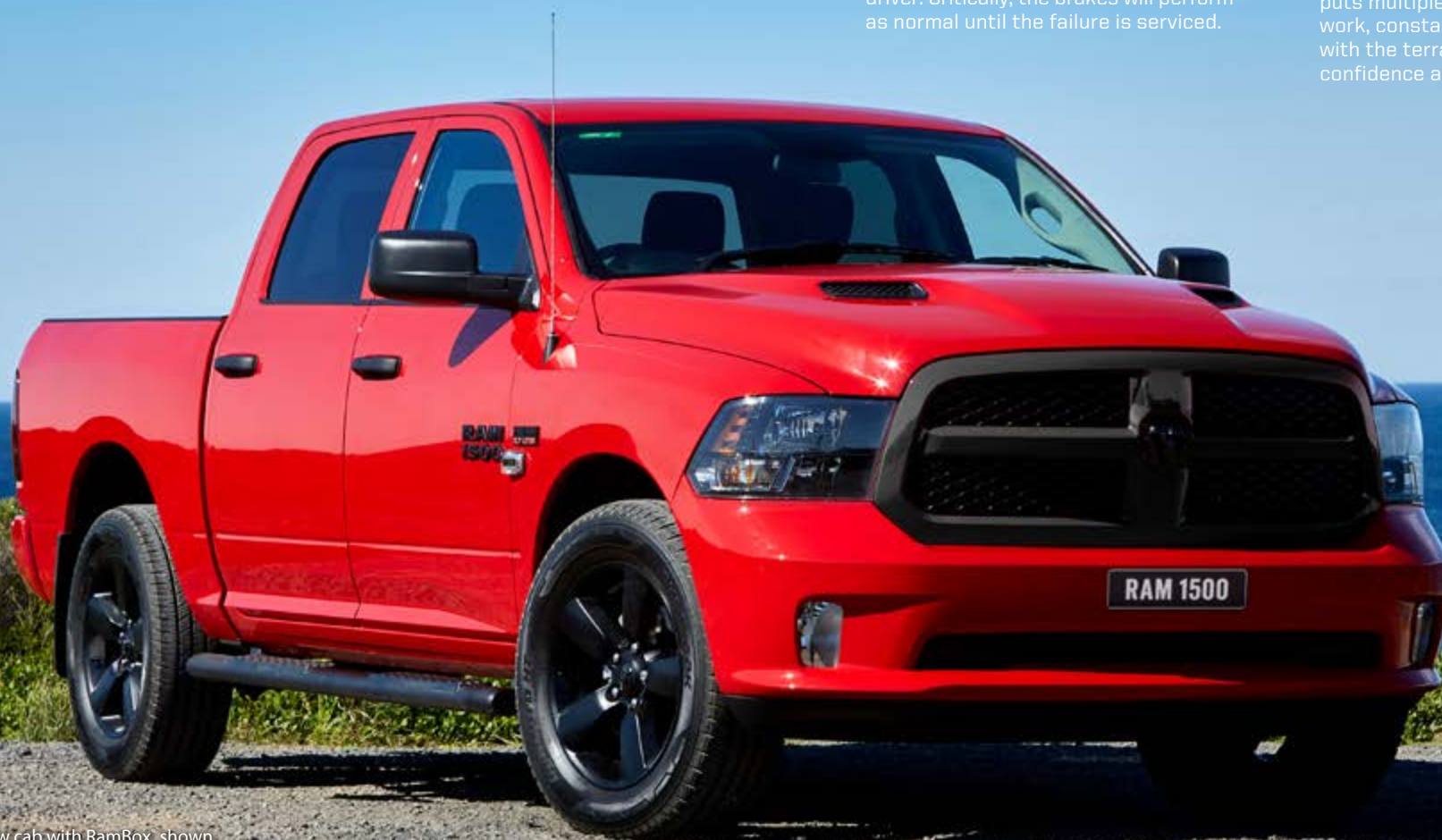
Express Crew cab with RamBox® shown.

When you're moving, your Ram 1500 Express® puts multiple systems and technologies to work, constantly assessing and interacting with the terrain, weather and trailer for total confidence and convenience.