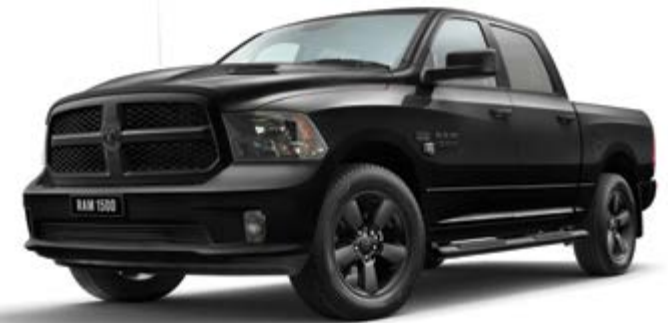
Diamond Black (P)

M = Metallic, P = Pearlescent. Colours have been reproduced as faithfully as possible, however actual colours may vary due to screen settings.