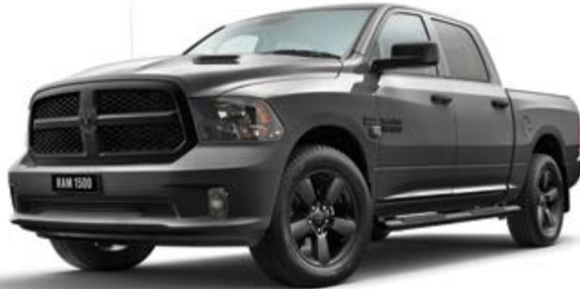
Granite Crystal (M)