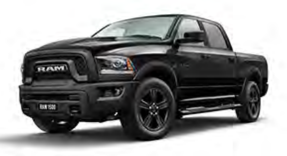
Diamond Black (P)