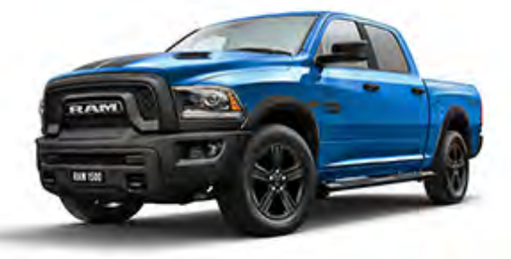
Hydro Blue (P)