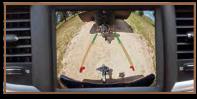
STANDARD PARKVIEW® REAR BACK-UP CAMERA With the handy Active Grid Lines, you'll find backing up-like to a trailer hitch-easy and convenient.