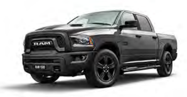
Granite Crystal (M)