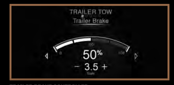
TRAILER BRAKE CONTROLLER It's just part of dozens of menu options in your control. This shows the brake set at 50% of operation with a 3.5% gain.