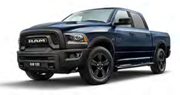
Patriot Blue (P)

M = Metallic, P = Pearlescent. Colours have been reproduced as faithfully as possible, however actual colours may vary due to screen settings.