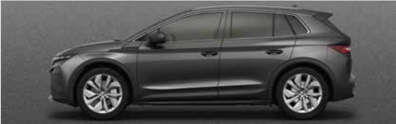
Graphite Grey metallic