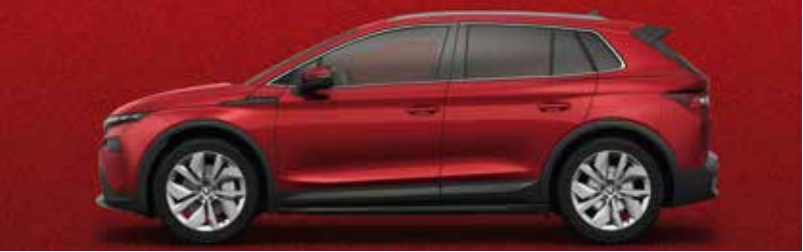
Velvet Red metallic