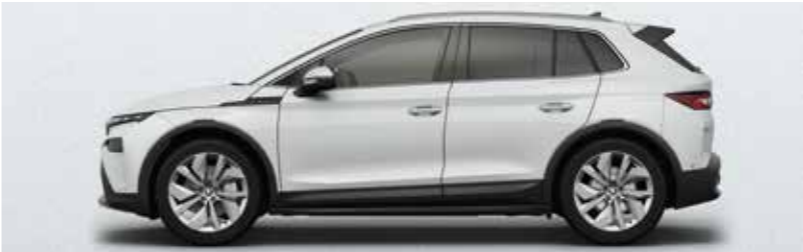
Moon White metallic