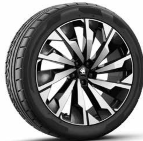
20" Asterion black metallic alloy wheels