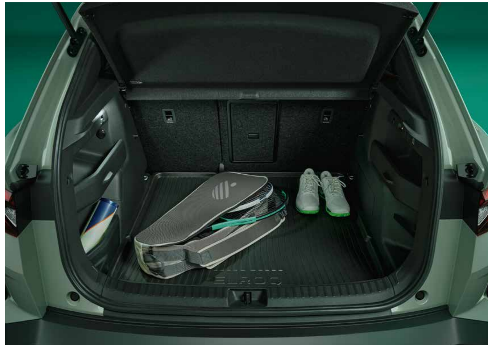
Protective boot liner