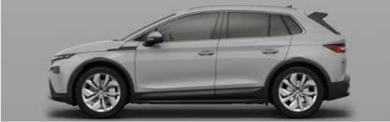
Steel Grey uni