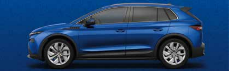
Race Blue metallic