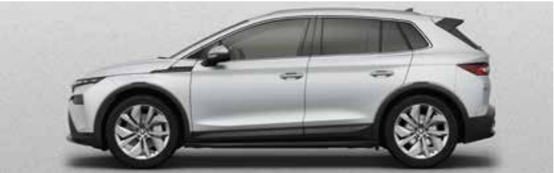
Brilliant Silver metallic