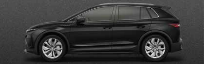
Black Magic metallic