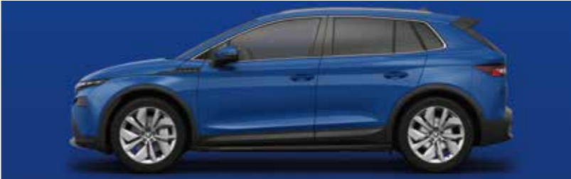
Energy Blue uni