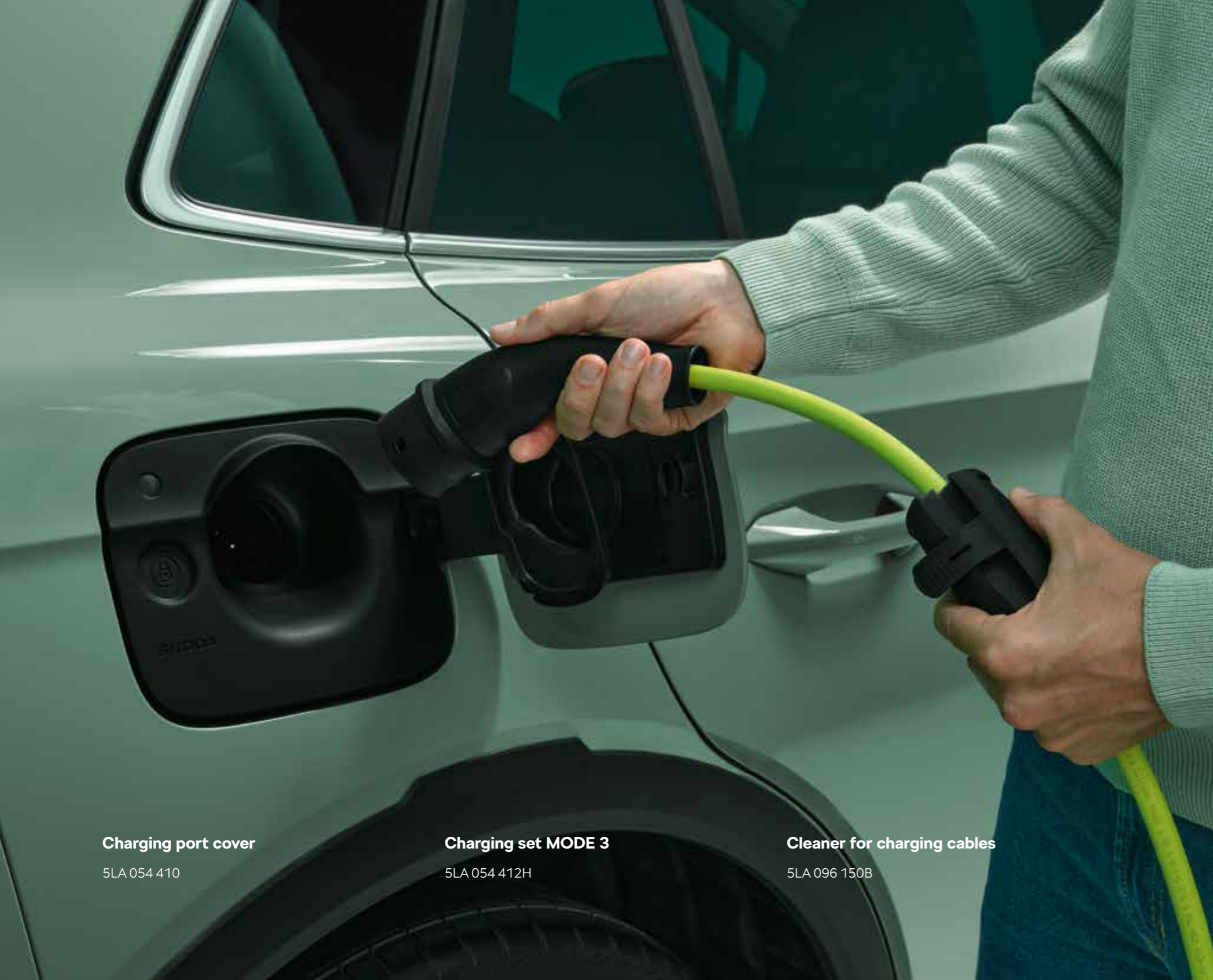
Charging port cover