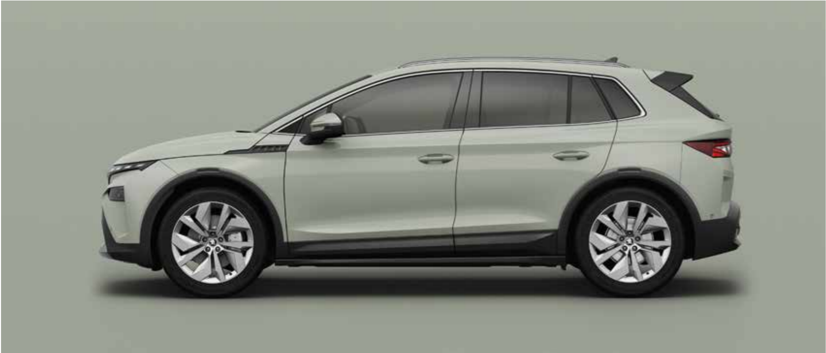
Timiano Green uni