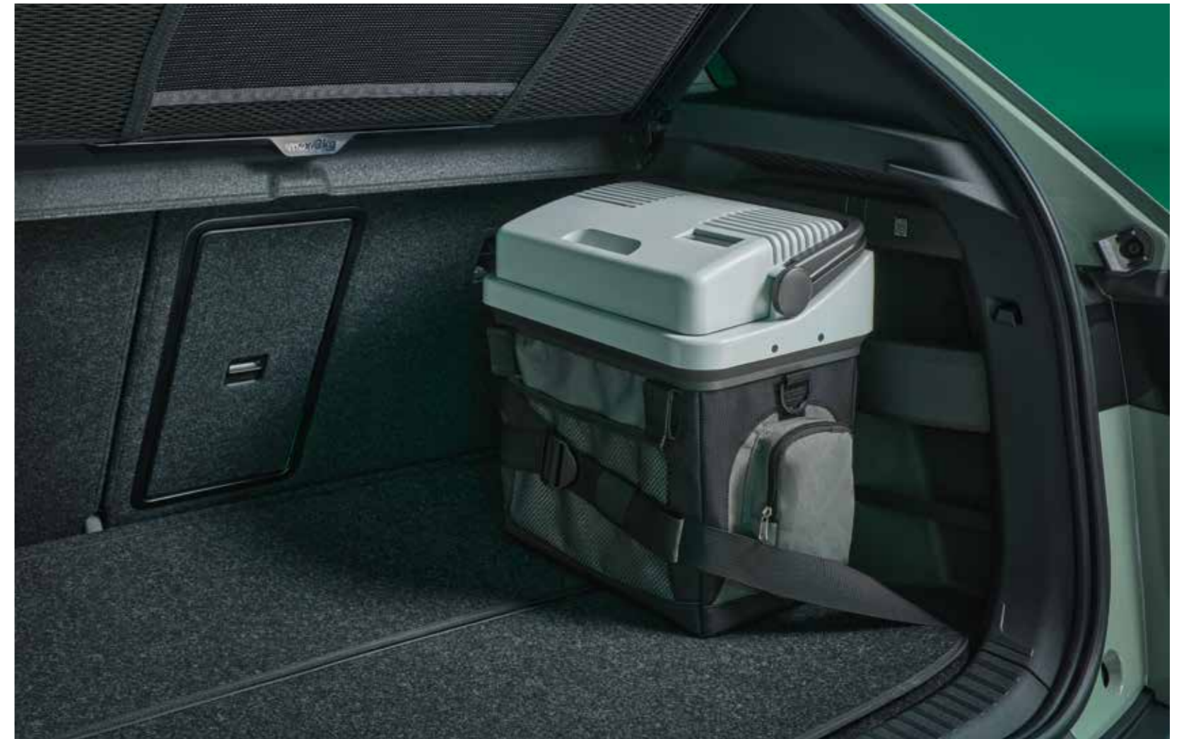
Fixing boot strap

A spacious boot is even more useful when it's neatly organised. Stash the charging cables to the bag and fix luggage with fixing straps or elements. You can even place your food and drinks into a thermo-electric cooling box.