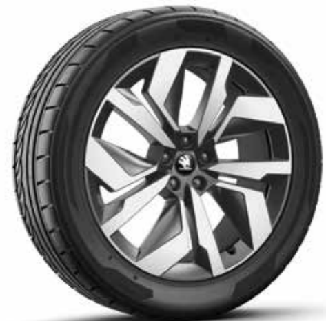
20" Vega black alloy wheels