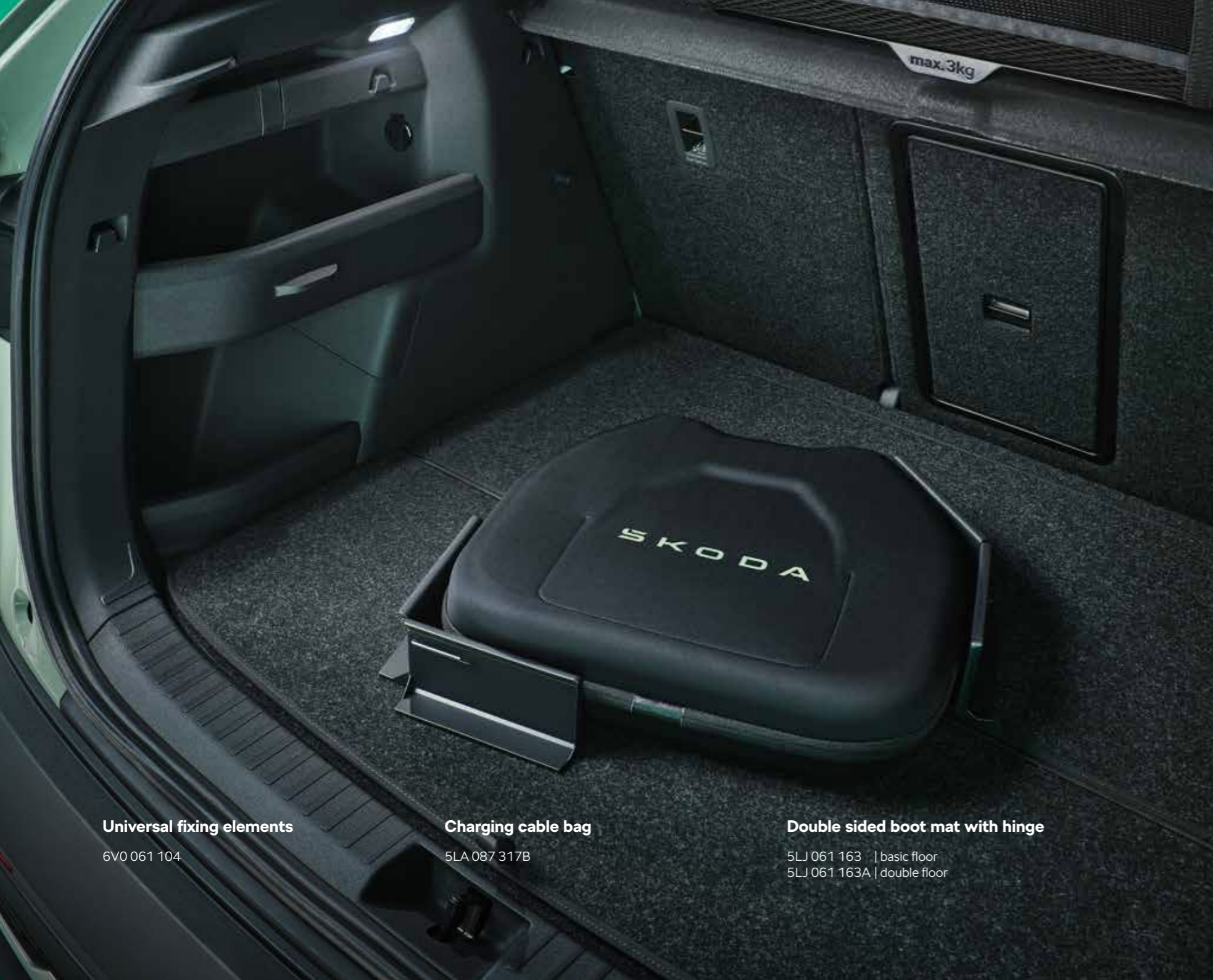
Universal fixing elements