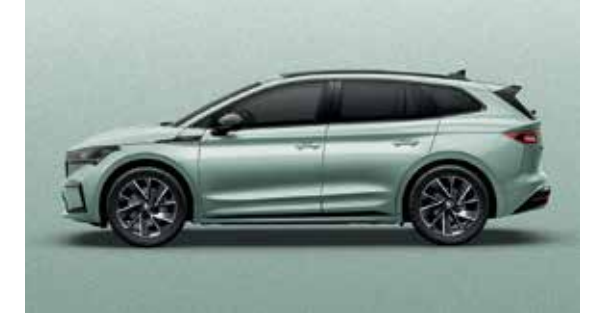
Arctic Silver (not available in Coupe)