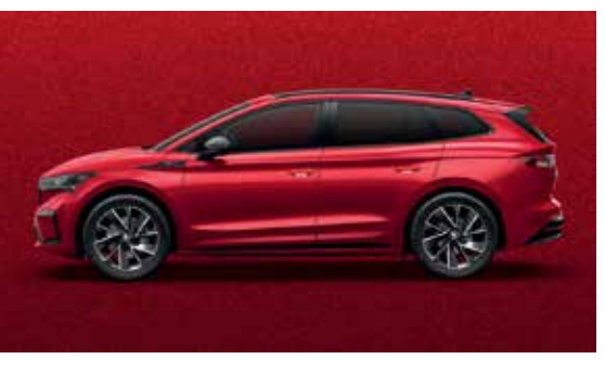
Velvet Red Metallic