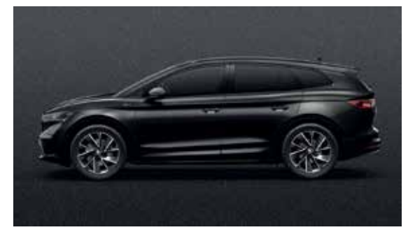
Magic Black Metallic