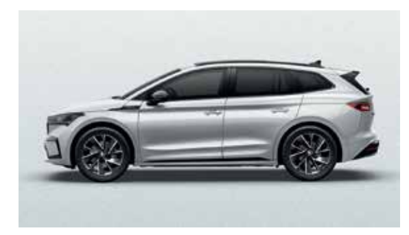
Moon White Metallic