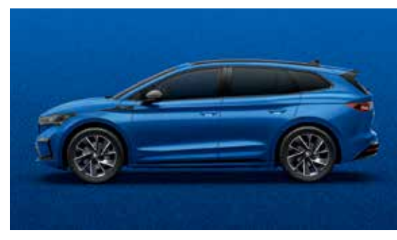
Race Blue Metallic