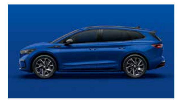
Energy Blue Uni