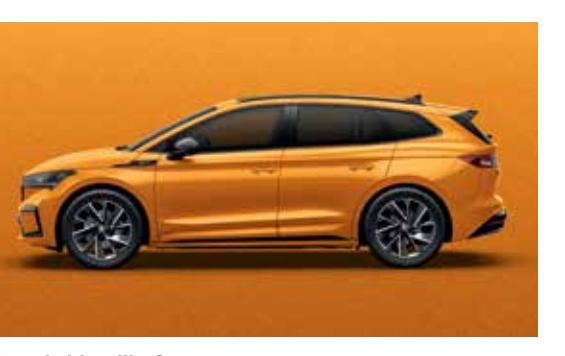
Phoenix Metallic Orange