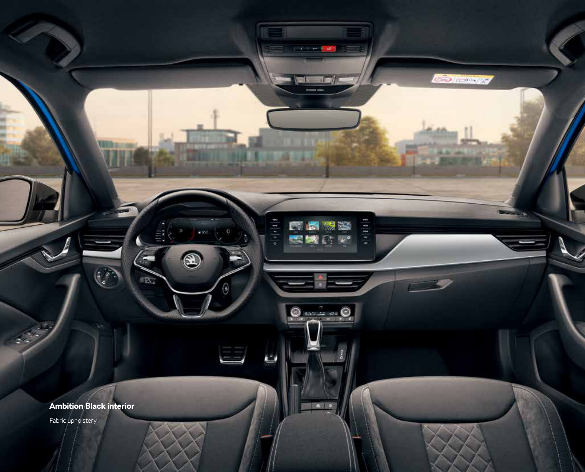
Ambition Black interior