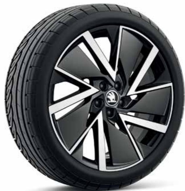
Optional - 18" Vega Aero black/silver alloy wheels, polished