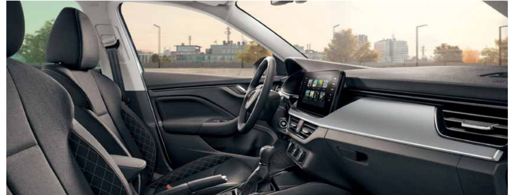
Ambition Black interior

The standard equipment of the Ambition version includes external side-view mirrors and door handles in the body colour, fog lamps, Jumbo box, umbrella compartment including Škoda umbrella, storage compartments under the front seats, sunglasses compartment, manual air conditioning, front seats with manually-adjustable lumbar support, 12V socket in the luggage compartment, and more.