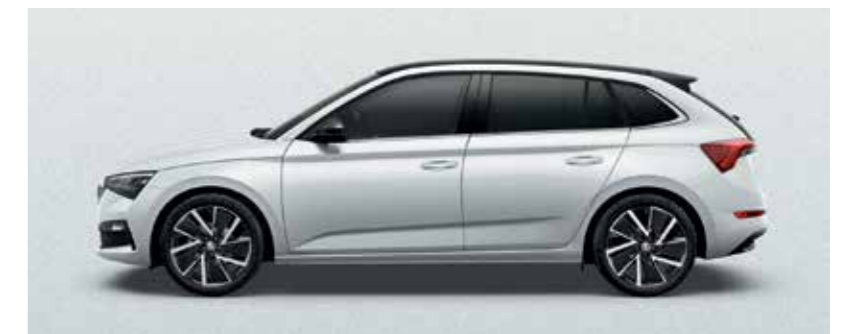
Moon White metallic