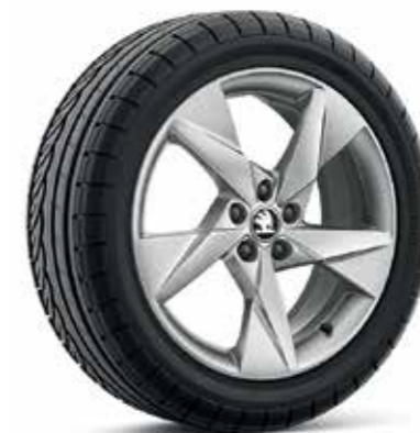
Optional - 17" Volans alloy wheels