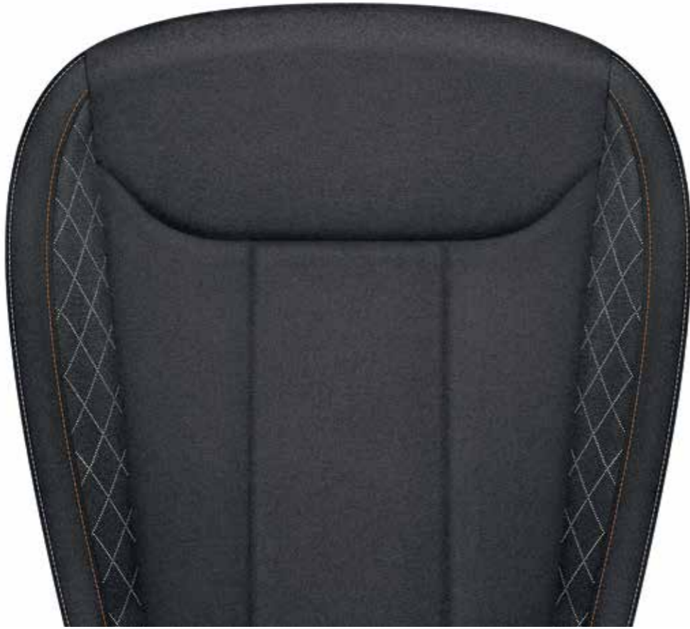
Ambition Satin Black (fabric)