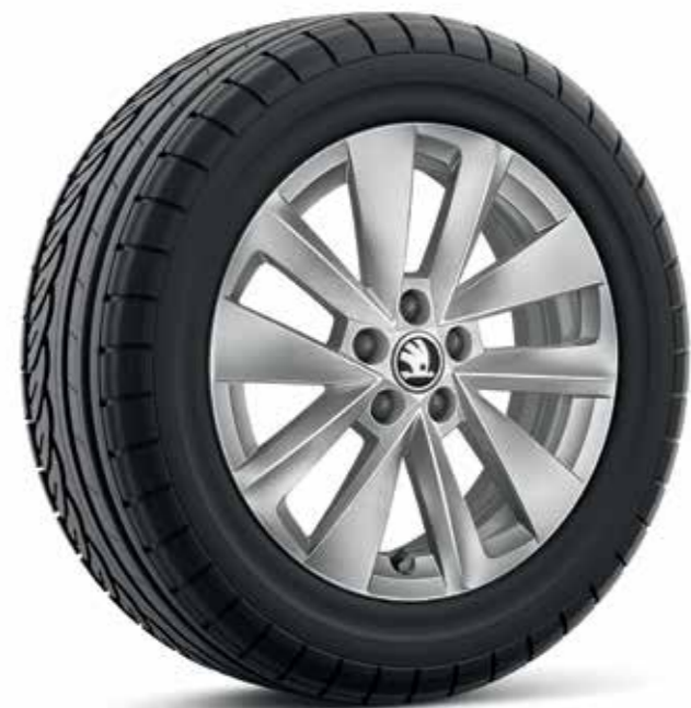
16" Sargas Aero alloy wheels