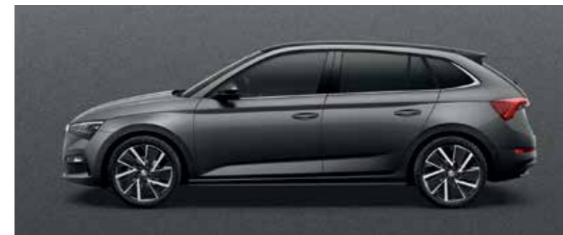
Graphite Grey metallic