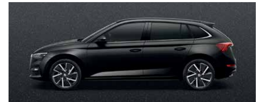
Magic Black metallic