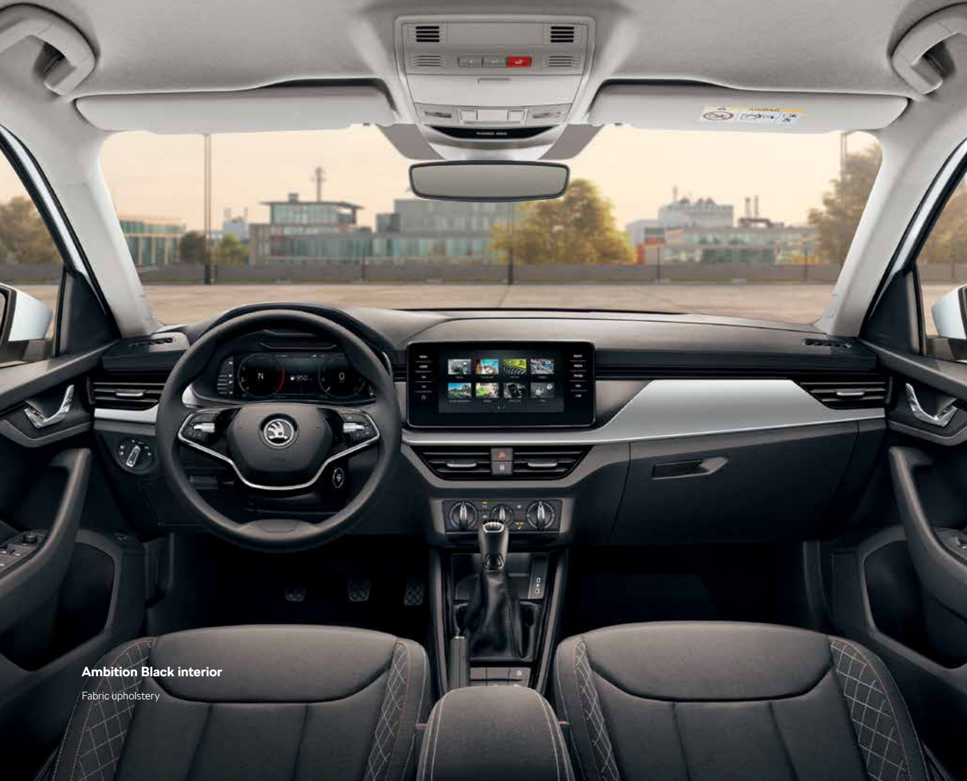
Ambition Black interior