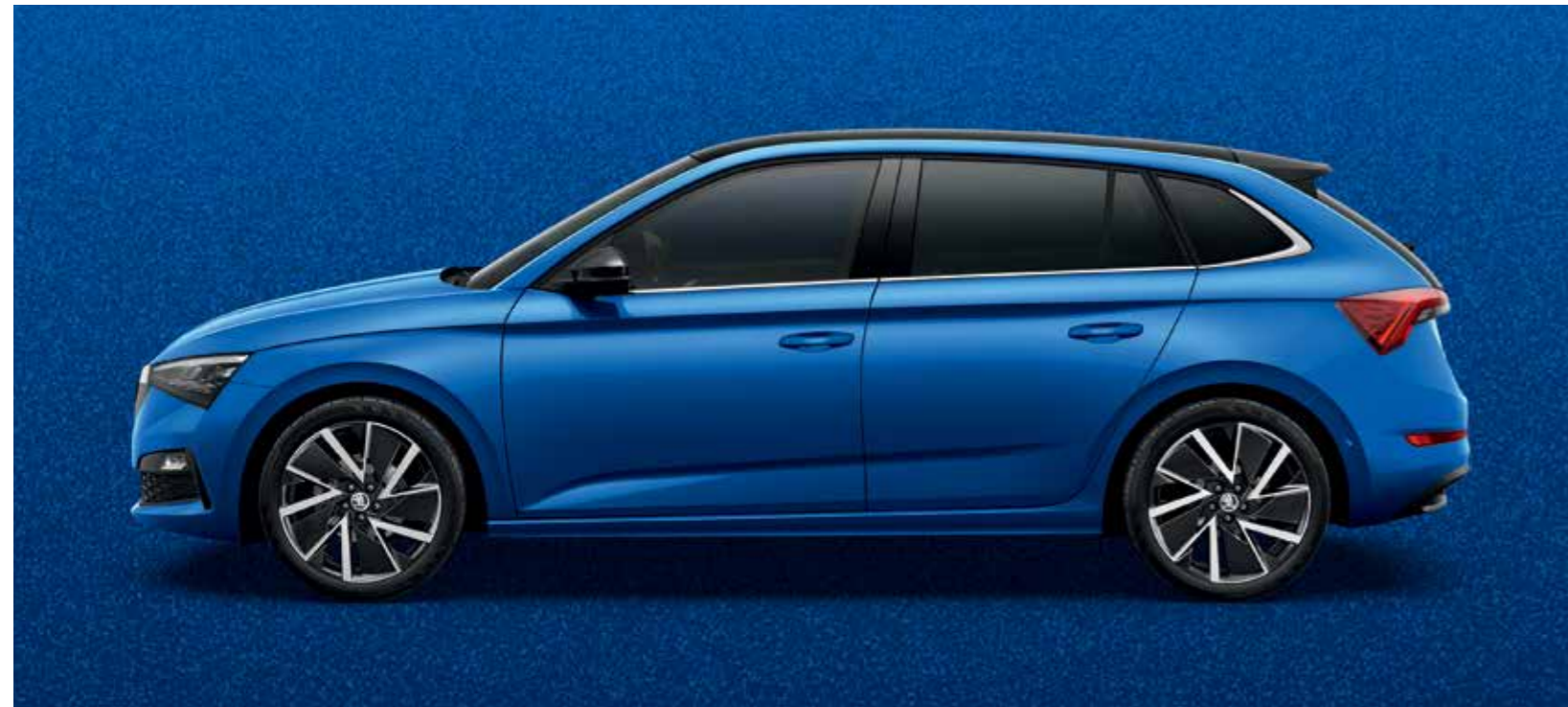
Race Blue metallic