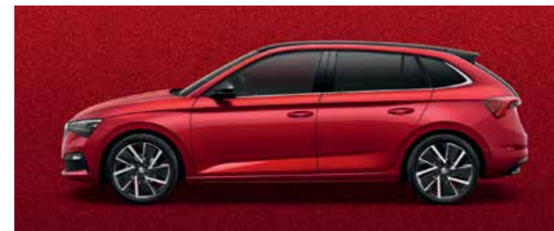
Velvet Red metallic