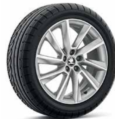
Optional - 17" Stratos alloy wheels