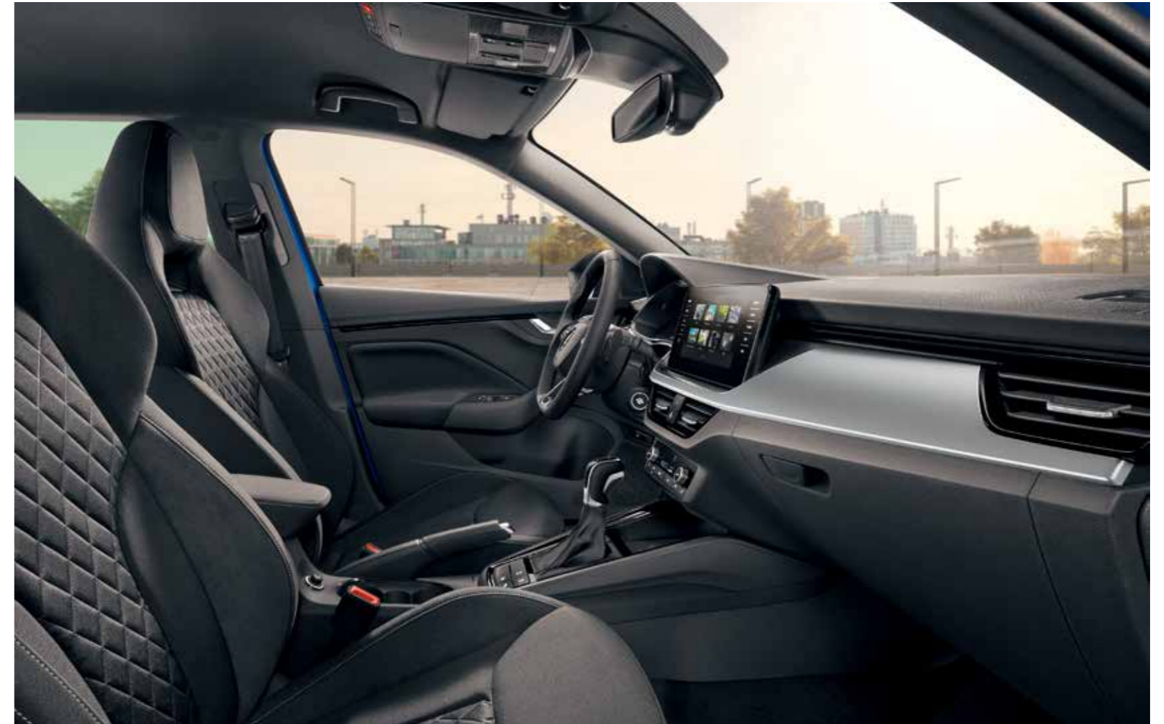
Ambition Black interior

The optional Dynamic package, which is fitted to Sport and Style versions includes sports seats, multifunctional sports steering wheel, noble steel foot pedal covers and black ceiling. Available to order at time of purchase.