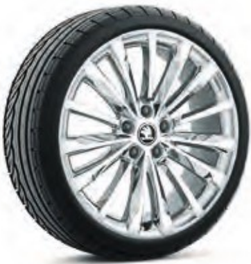
19" TRINITY super glossy alloy wheels