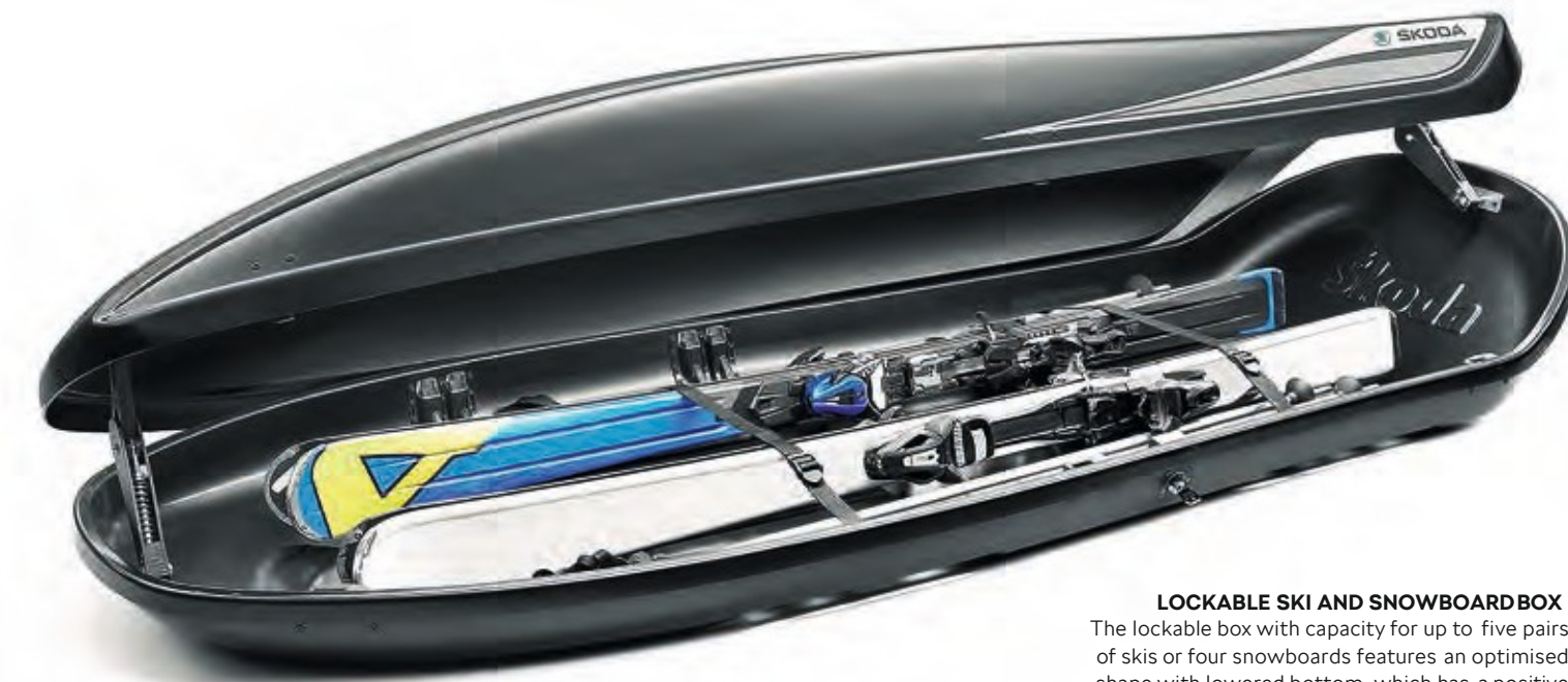
LOCKABLE SKI AND SNOWBOARD BOX The lockable box with capacity for up to five pairs of skis or four snowboards features an optimised shape with lowered bottom, which has a positive effect on driving stability and limits vibrations.