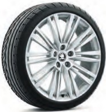
19" CANOPUS alloy wheels