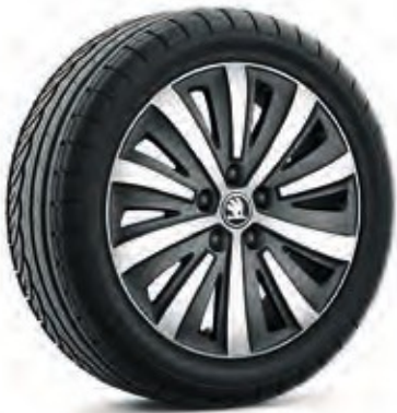
17" DRAKON alloy wheels