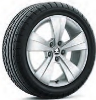
17" TRITON alloy wheels