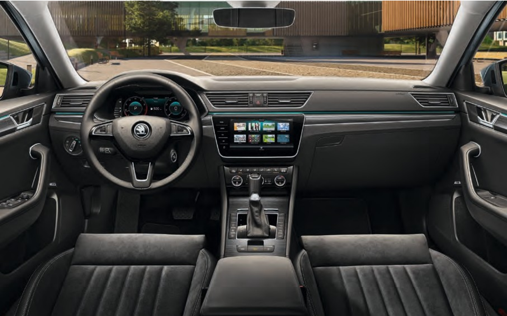
STYLE BLACK INTERIOR Argento zebrano décor Alcantara®/leather/leatherette upholstery

The standard equipment of the Style version includes LED fog lamps with corner function, decorative door sill strips front and rear, foot rest area illumination front and rear, electrically-adjustable driver seat with memory function, Manoeuvre Assist, Park Distance Control, plus more.