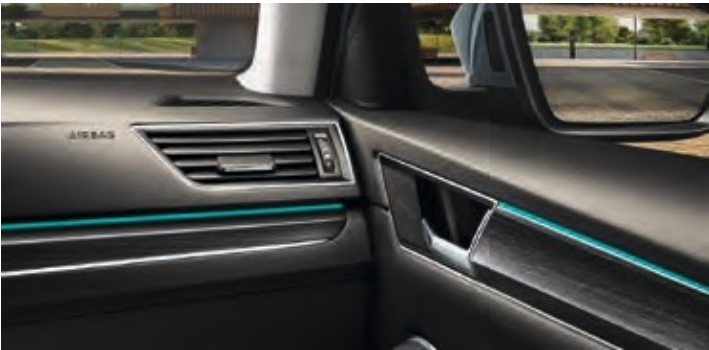
Turquoise ambient lighting

LED AMBIENT LIGHTING You can choose your favourite colour, or complement each day with one of ten amazing colour options. This is also reflected by the Virtual Cockpit or Maxi DOT colour display background illumination.