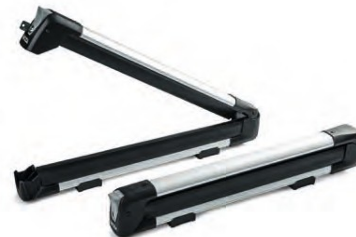
LOCKABLE SKI OR SNOWBOARD RACK The lockable ski or snowboard rack with aluminium profile, which has passed ŠKODA's load tests and safety tests, provides capacity up to five pairs of skis or two snowboards.*