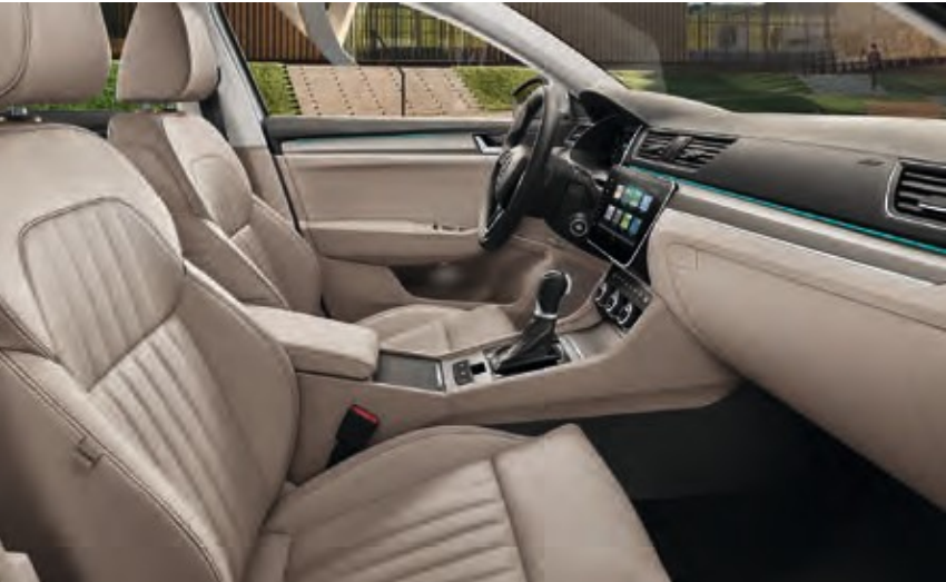
STYLE BEIGE INTERIOR Beige Brushed décor Leather/leatherette upholstery, ventilated front seats