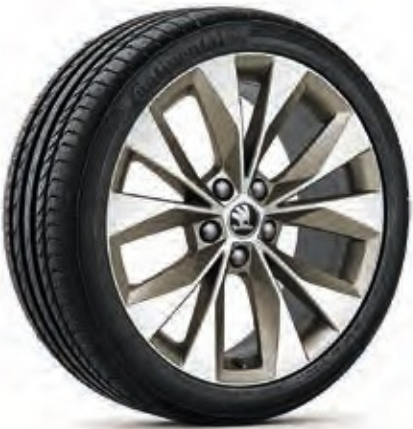
18" CASSIOPEIA platinum matt alloy wheels, brushed