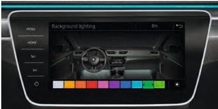
LED ambient lighting with ten colour options

DECORATIVE FEATURES The interior features high-quality materials and precise workmanship, which is highlighted with the armrest and upholstery stitching. Plenty of chrome details can be found on the dashboard, doors, steering wheel and gearstick knob.