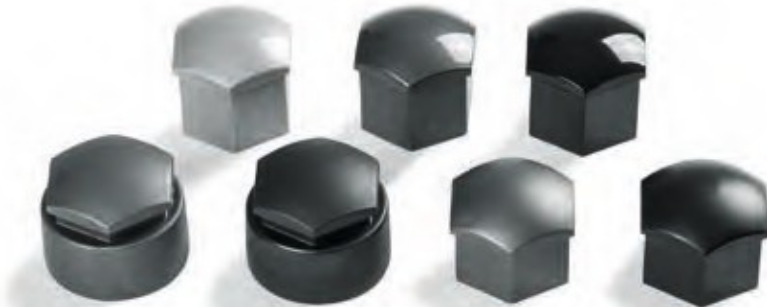
BOLT CAPS Decorative bolt caps for wheels with and without safety bolts.