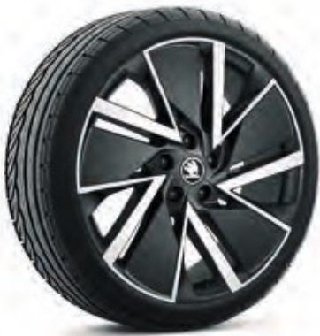
19" VEGA Aero black alloy wheels