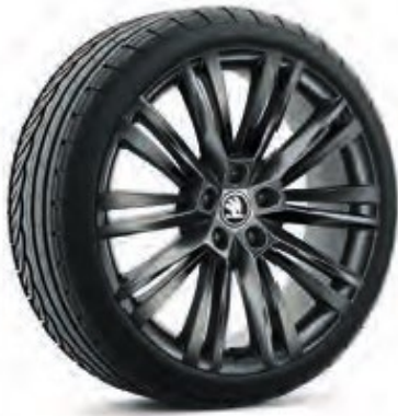
19" CANOPUS glossy black alloy wheels