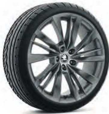
19" ACAMAR anthracite alloy wheels