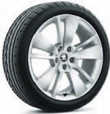
18" ZENITH alloy wheels