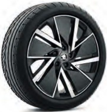
18" VELA black alloy wheels with aero covers*