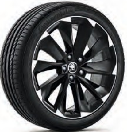
19" SUPERNOVA black gloss alloy wheels, brushed