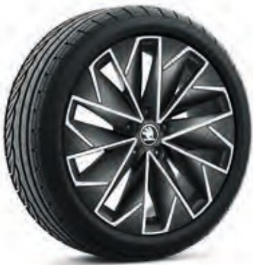
18" PROPUS Aero black alloy wheels