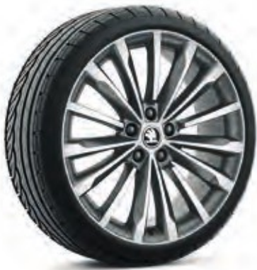
19" TRINITY anthracite alloy wheels