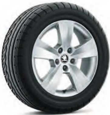
16" ORION alloy wheels