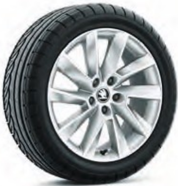
17" STRATOS alloy wheels