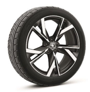
20" Taurus alloy wheels