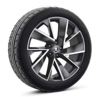
20" Vega alloy wheels