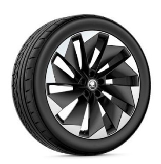
21" Supernova alloy wheels

Škoda reserves the right to make changes to specifications, colours and prices without notice. Whilst we make every effort to ensure that specifications are accurate at the time of publication, you should always check with your Škoda dealer for the latest information.