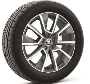
17" Braga alloy wheels