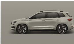
Steel Grey Uni