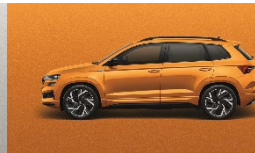
Phoenix Orange Metallic (+$1,000)