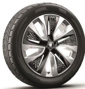
18" Procyon alloy wheels