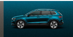
Lava Blue Metallic (N/A for Sportline)