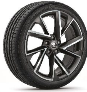
19" Vega alloy wheels