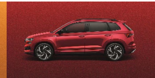
Velvet Red Metallic (+$1,000)