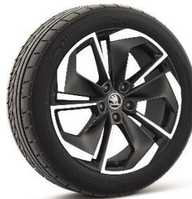
17" Rotare alloy wheels