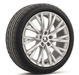
18" Antares alloy wheels