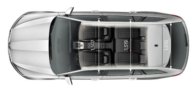
Technical drawing shown is Superb Style