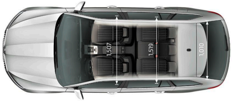
Technical drawing shown is Superb Style