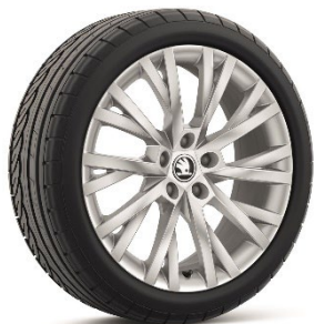
18" Antares alloy wheels