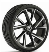
19" 'VEGA' Alloy