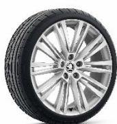
19" 'CANOPUS' Alloy