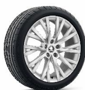
18" 'ATARES' Alloy