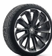
19" 'SUPERNOVA' Alloy