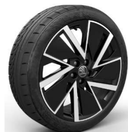
18" 'VEGA AERO' Alloys

* Fuel consumption values obtained using NEDC Standard and are based on European model.