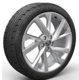
18" 'VEGA' Alloys