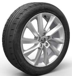
17" 'STRATOS' Alloys