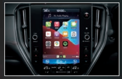
Subaru WRX AWD tS shown.

Advanced all-inclusive kit includes a seriously sophisticated high-tech infotainment unit – with a 11.6" tablet-like infotainment touchscreen. Never straying far from its roots, Subaru WRX lights up your world with electroluminescent gauges, Sports instrument cluster with Multi-Information Display unit and metallic sports pedals. Sink into re-designed body-hugging sports bucket seats, with powered and heated front seats¹ on selected variants and fit more in with the supersized cargo space of the Subaru WRX Sportswagon. Every single detail is a triumph of Subaru engineering and tech. Potent, taut and emphatic.