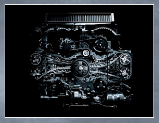
Horizontally-opposed Boxer engine

The heart and soul of Subaru WRX owes its vitality to the intersection of two irreplaceable forces - the iconic 2.4-litre turbocharged horizontally-opposed Boxer engine and Symmetrical All-Wheel Drive system. Designed to sit lower and flatter in the engine bay than traditional engines, Boxer's unique design delivers less noise and vibration to the cabin, while the low centre of gravity improves stability, cornering and traction with the road.