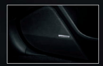
Subaru WRX AWD tS shown.

High visibility, rally-inspired Sports instrument cluster with large tachometer and speedometer dials.