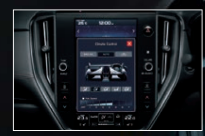
Subaru WRX AWD tS shown.

10 Harman Kardon<sup>*5</sup> speakers, subwoofer and amplifier in Subaru WRX AWD RS, Subaru WRX AWD tS. While all Sportswagon variants include 10 Harman Kardon<sup>*</sup> speakers and amplifier.