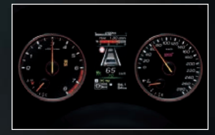
Subaru WRX AWD tS shown.

11.6" touchscreen, Wireless Apple CarPlay® and Android Auto™ connectivity², digital radio (DAB+)³ and Bluetooth ®⁴ wireless technology.