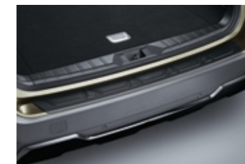
Rear Step Panel

*Accessories shown on different Subaru model.