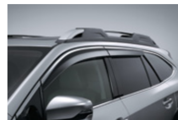
Window Weather Shield