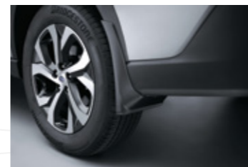
Mud Flap Set*