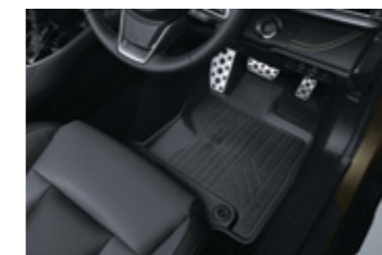
Rubber Mat Set