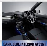
DARK BLUE INTERIOR ACCENT