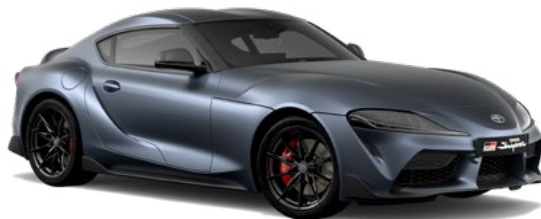
● Nurburg Matte Grey 4 D08