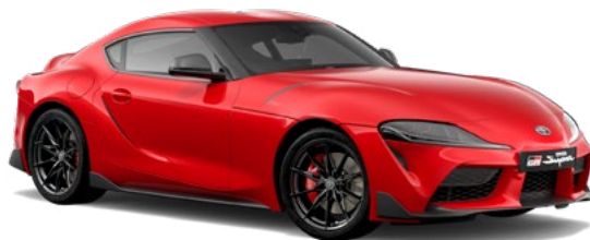
● Monza Red D05