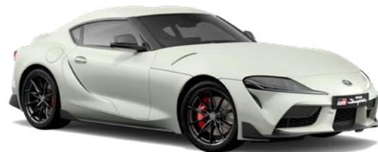
○ Matte White 4 D12