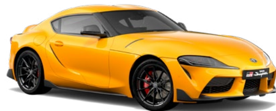
● Silverstone Yellow 4 D06