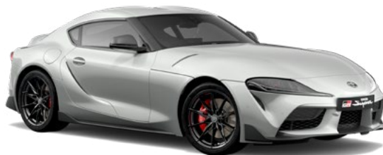
○ Fuji White 4 D01

The on-road performance of GR Supra is matched by a powerful range of colour choices. Whether you prefer bold or a subtle style, there's a perfect colour to match.