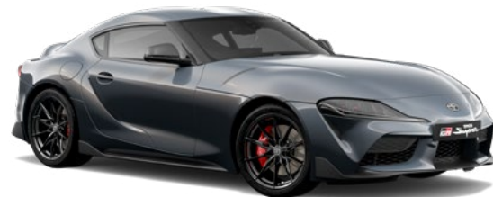
● Copper Grey 4 D14