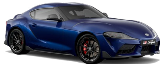
● Azure Blue 4 D13