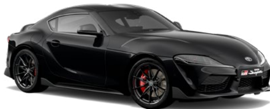
● Bathurst Black 4 D04