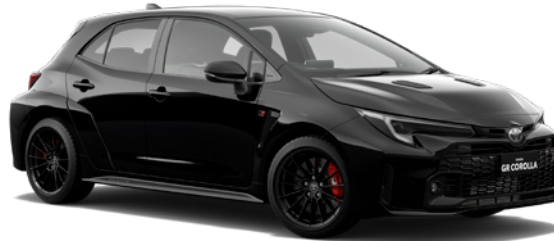
● Ebony 13 202