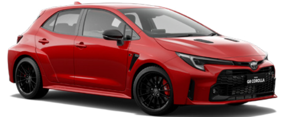
● Feverish Red 13 3U5