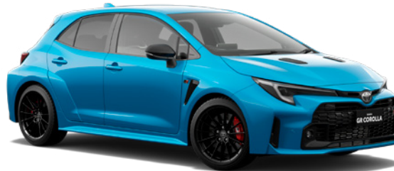
● Eclectic Blue 13 8W9