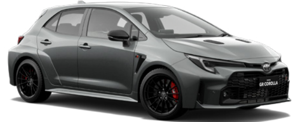
● Liquid Mercury 13 1L5