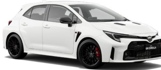
○ Glacier White 040

Choose your colour for GR Corolla and make your mark on the road. From simple white to bold statements in style, you're sure to find one to match your desire for thrilling performance on any road, every day.