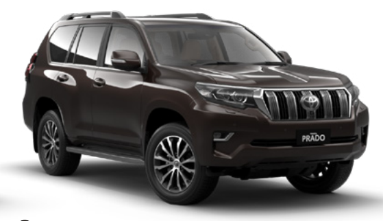
Espresso Brown<sup>13</sup> 4X4