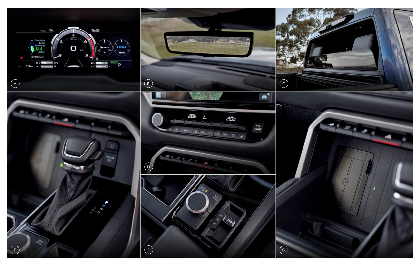
A 12.3" Multi Information Display B Digital rear-view mirror