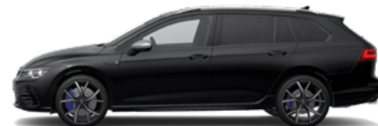
Deep Black PE