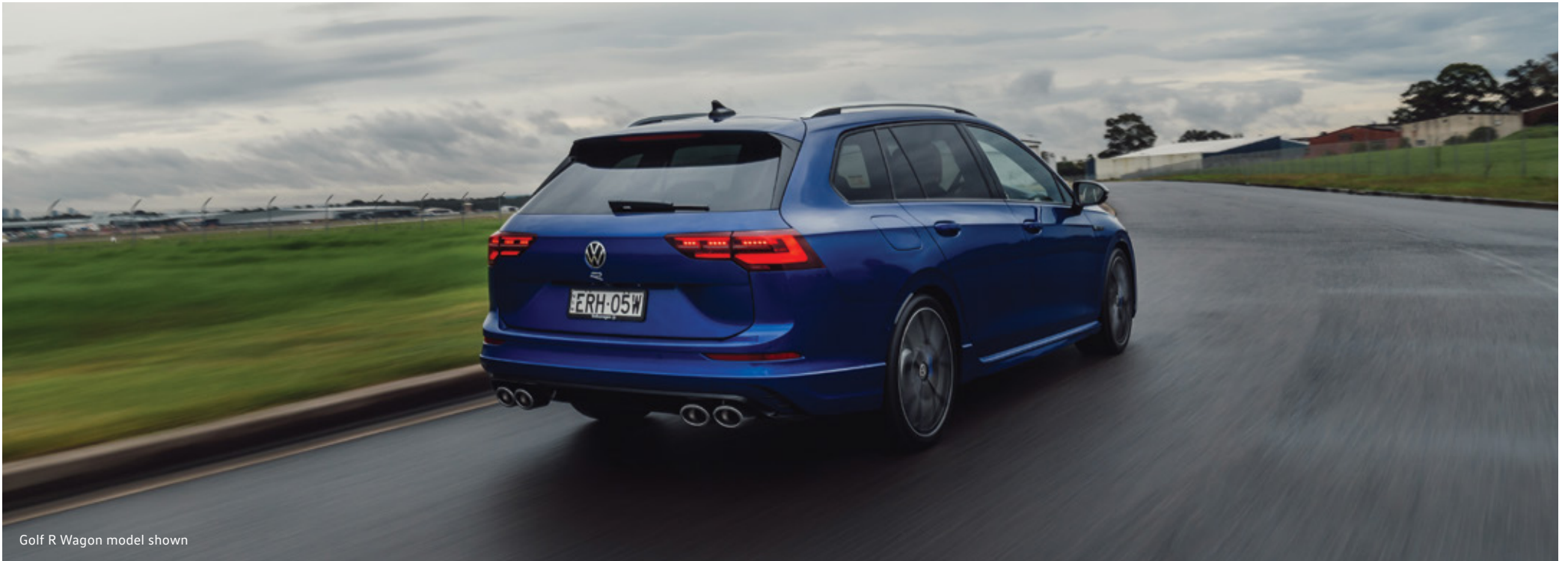
Golf R Wagon model shown