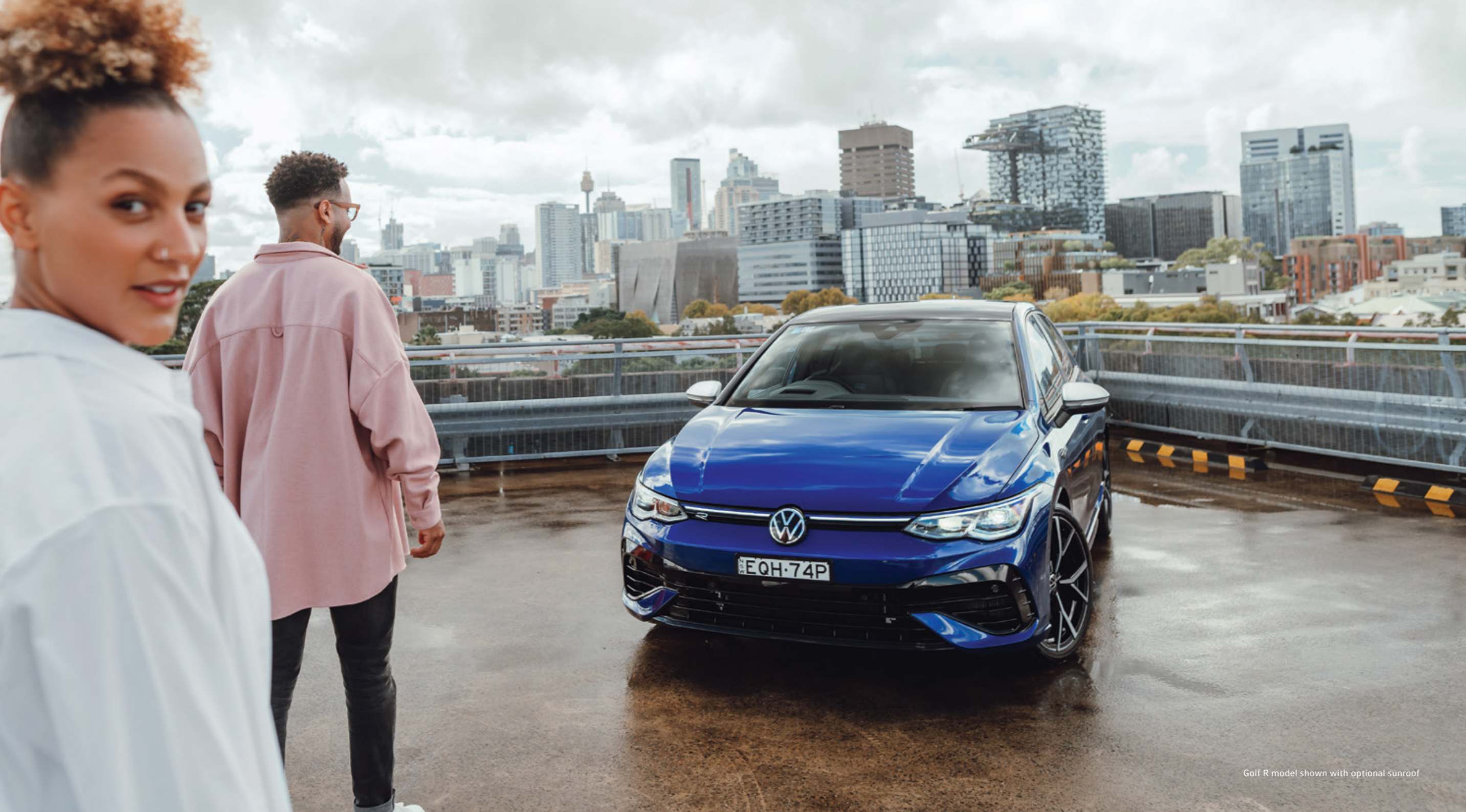
Golf R model shown with optional sunroof