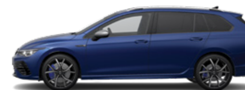
Lapiz Blue PM