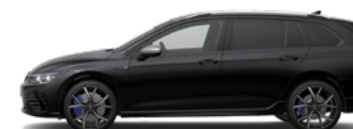
Deep Black PE