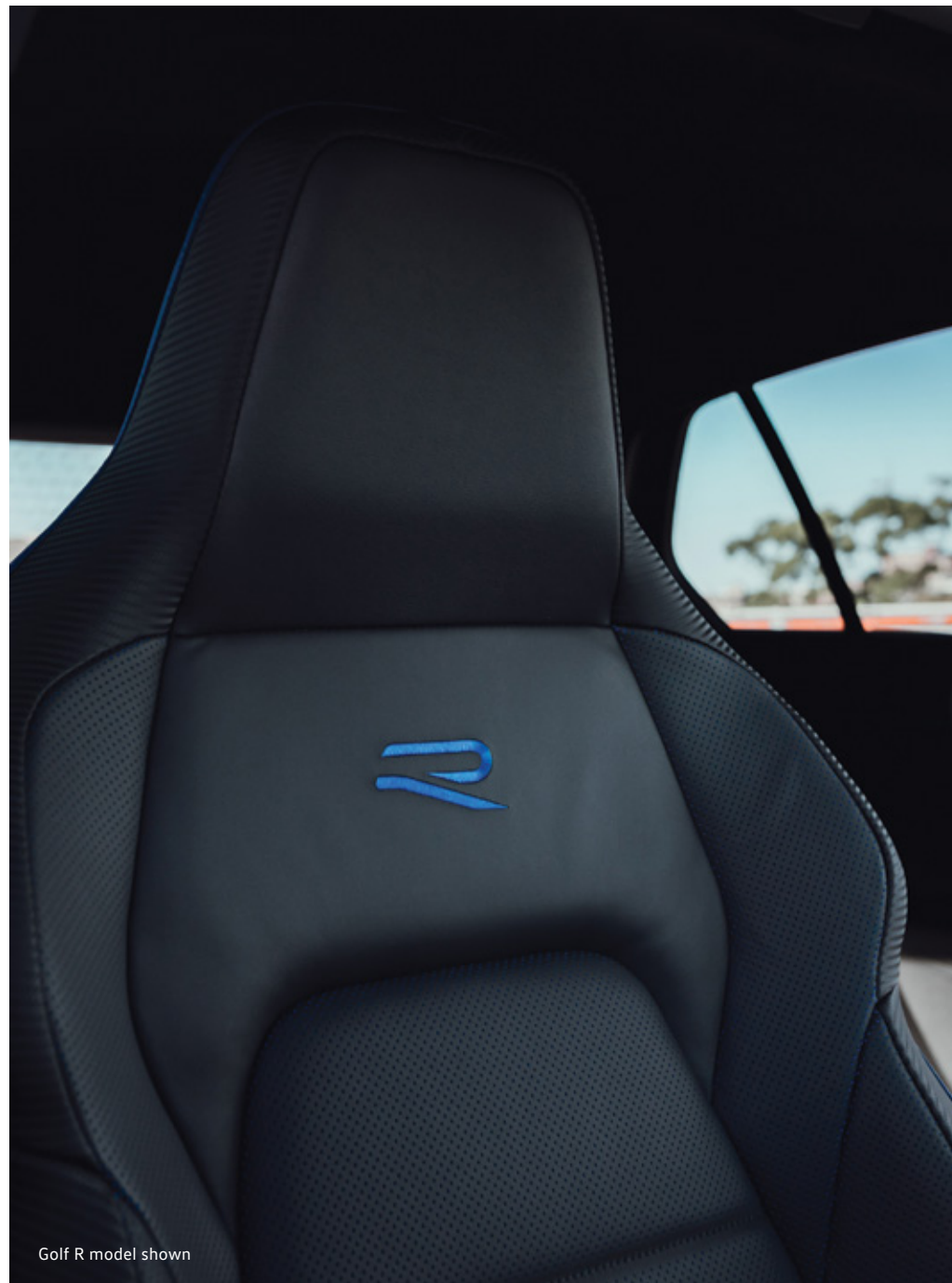
Golf R model shown

S Standard O Optional Extra P Available as part of an optional package — Not available