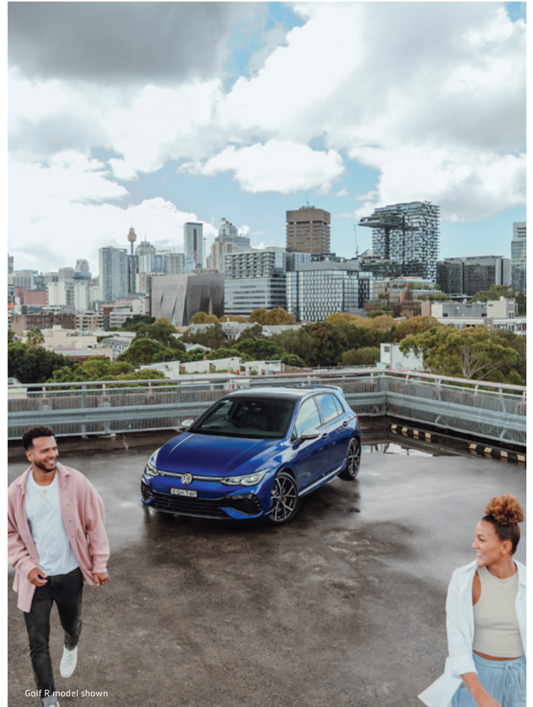
Golf R model shown