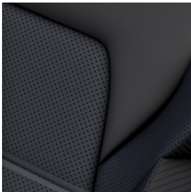
Black Nappa Leather appointed seat upholstery#