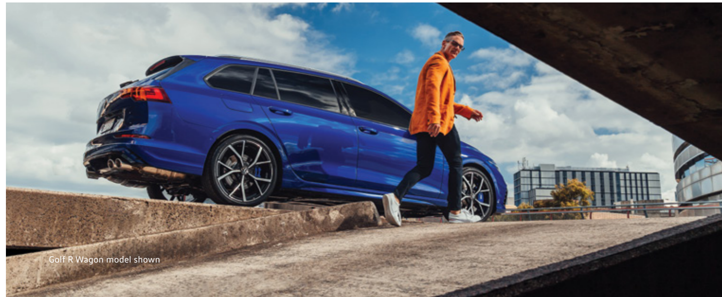
Golf R Wagon model shown

For further proof of the vehicle's uniquely potent styling, you need only look at the Golf R's imposing blue brake calipers. As well as providing outstanding on-road performance and ruthless stopping power, they are quintessentially a Golf R hallmark.