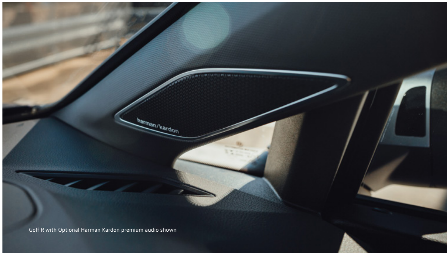
Golf R with Optional Harman Kardon premium audio shown

The Golf R's other optional inclusion, a panoramic electric glass sunroof, is the perfect addition to a car already brimming with great features. Let glorious light stream into the cabin when you retract the sunroof shade – and open up the sunroof for the liberating feeling of the wind in your hair.