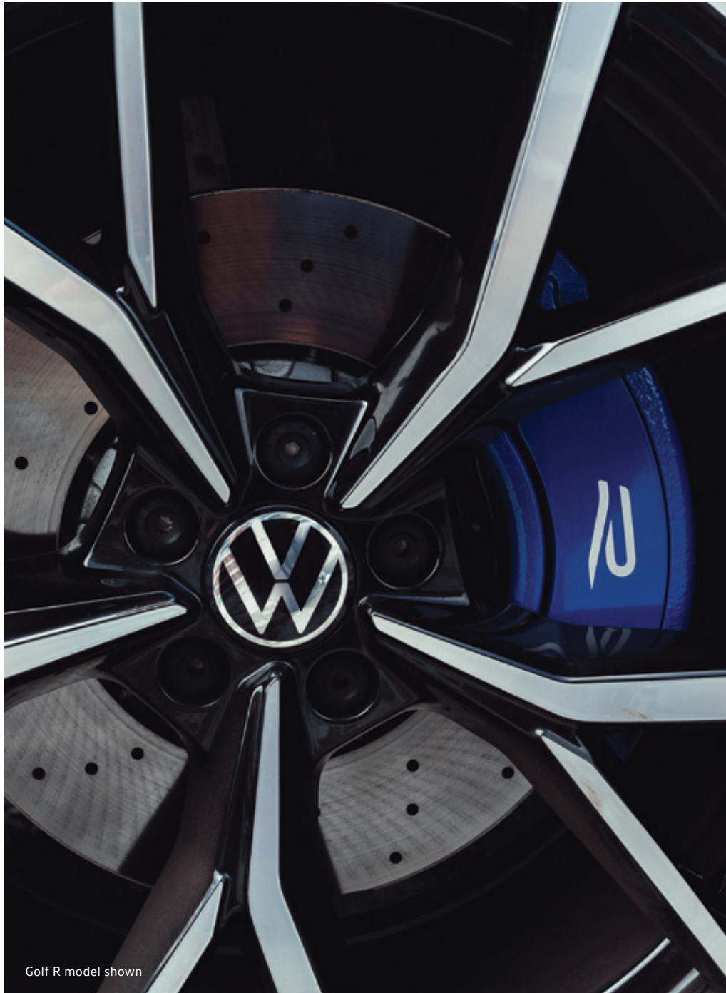
Golf R model shown