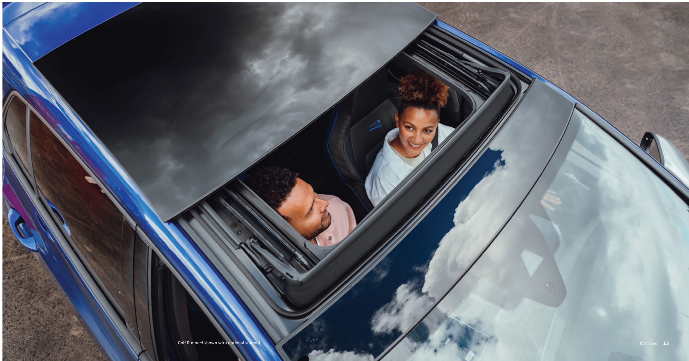
Golf R model shown with optional sunroof