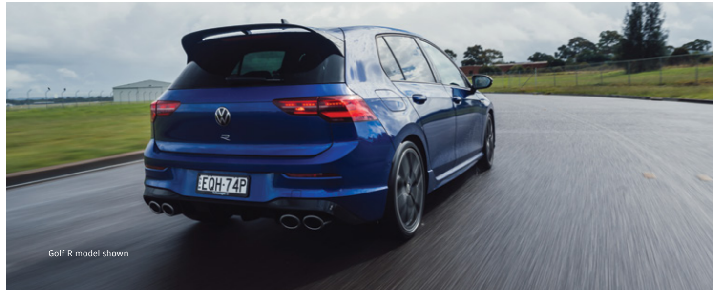
Golf R model shown

Of course, the Golf R has the looks to match its blistering on-road performance. With its lowered stance, large front air intake, body-coloured extended side sills and gloss black rear diffuser with four chrome exhaust pipes, the Golf R looks every inch a performance supercar.