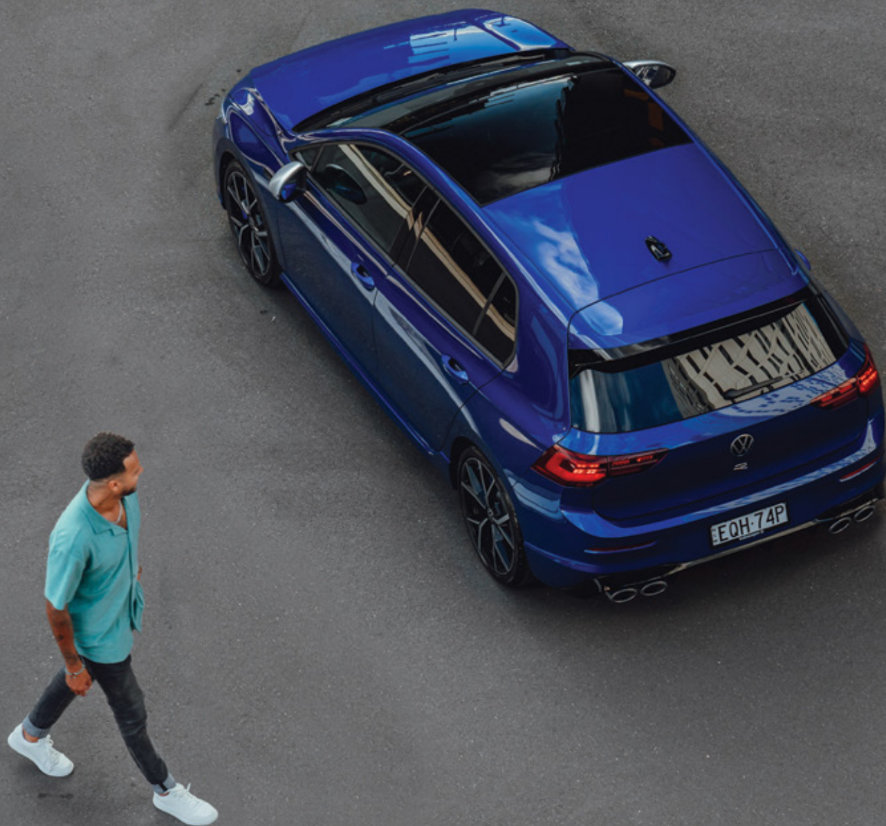
Golf R model shown with optional sunroof