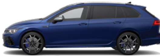
Lapiz Blue PM