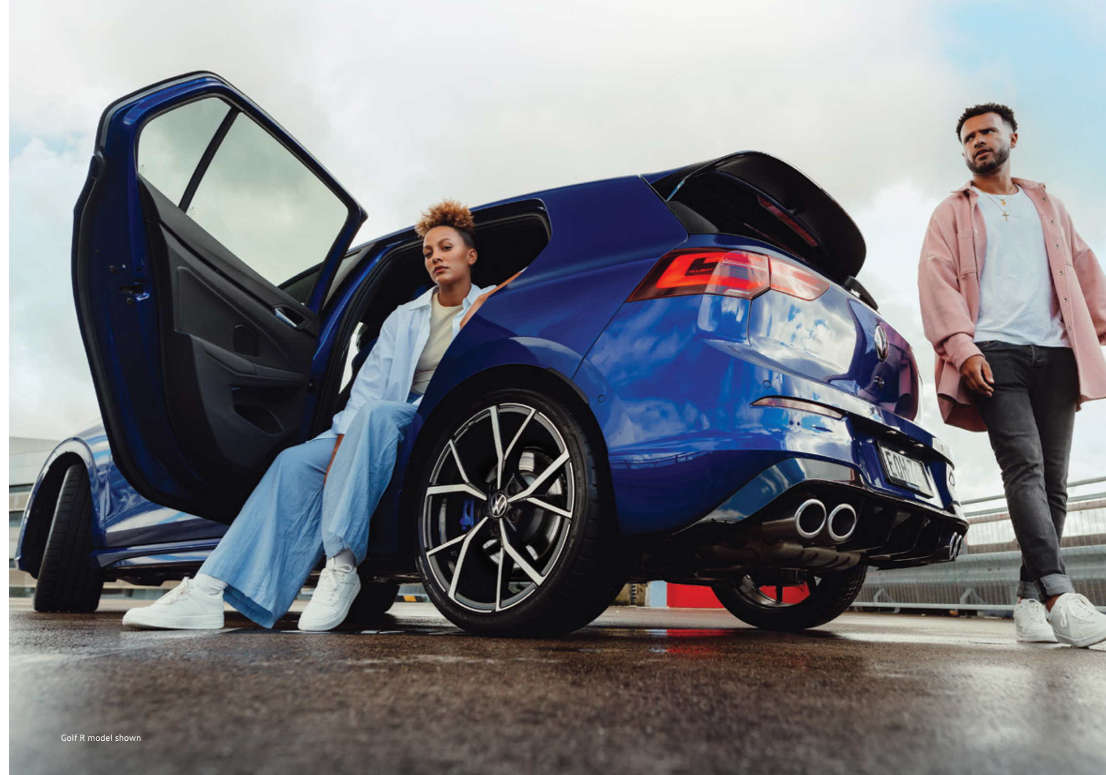
Golf R model shown