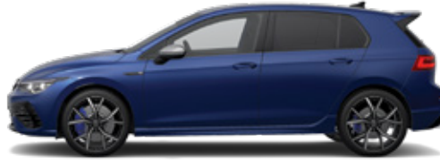
Lapiz Blue PM