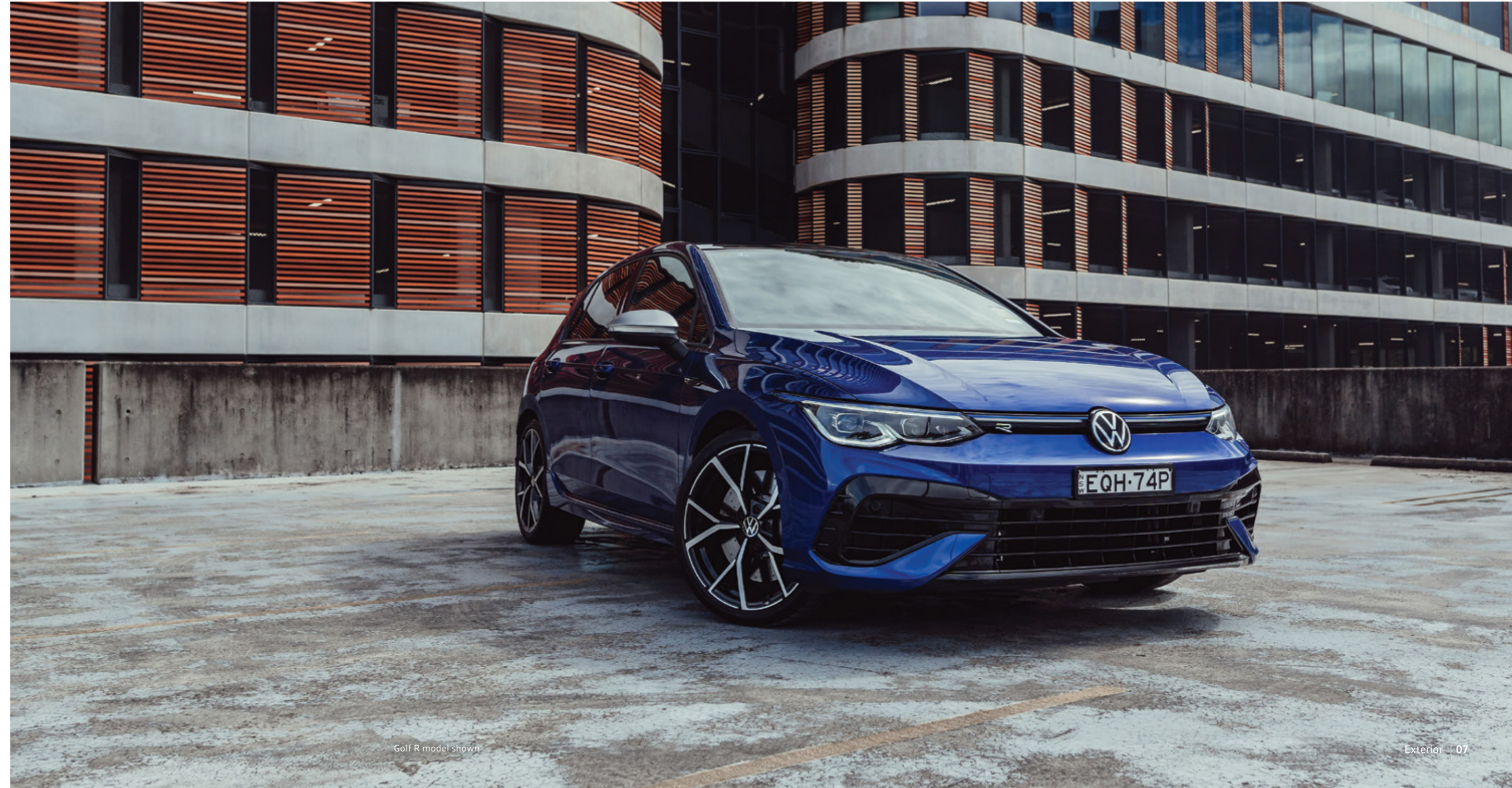
Golf R model shown