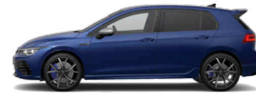
Lapiz Blue PM