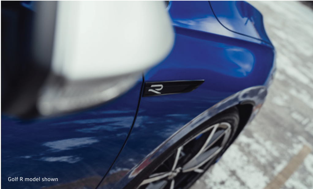
Golf R model shown