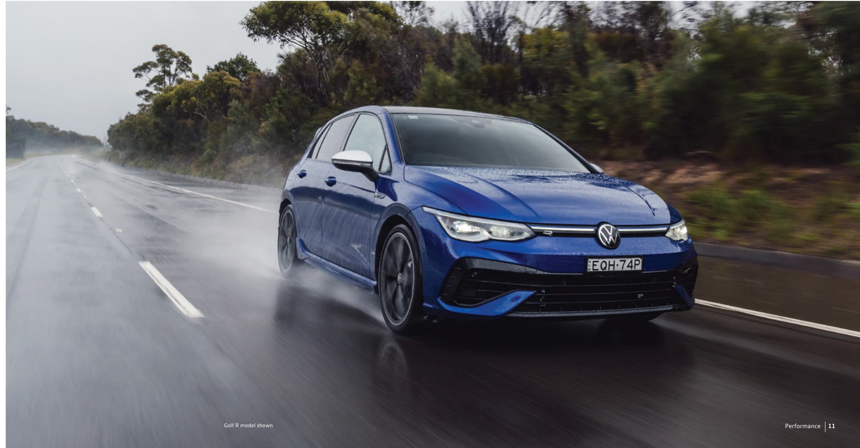
Golf R model shown