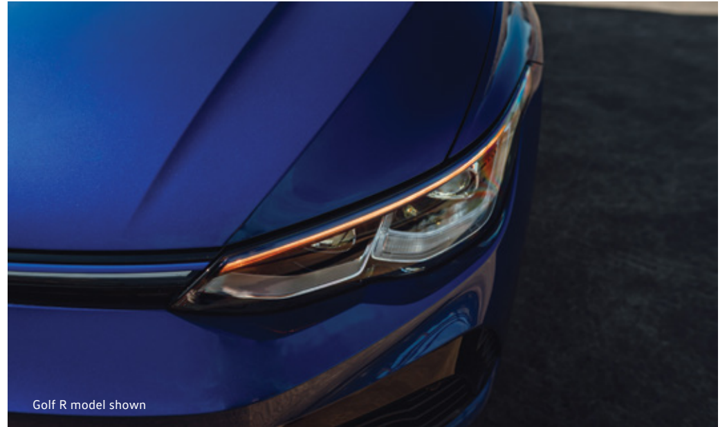
Golf R model shown