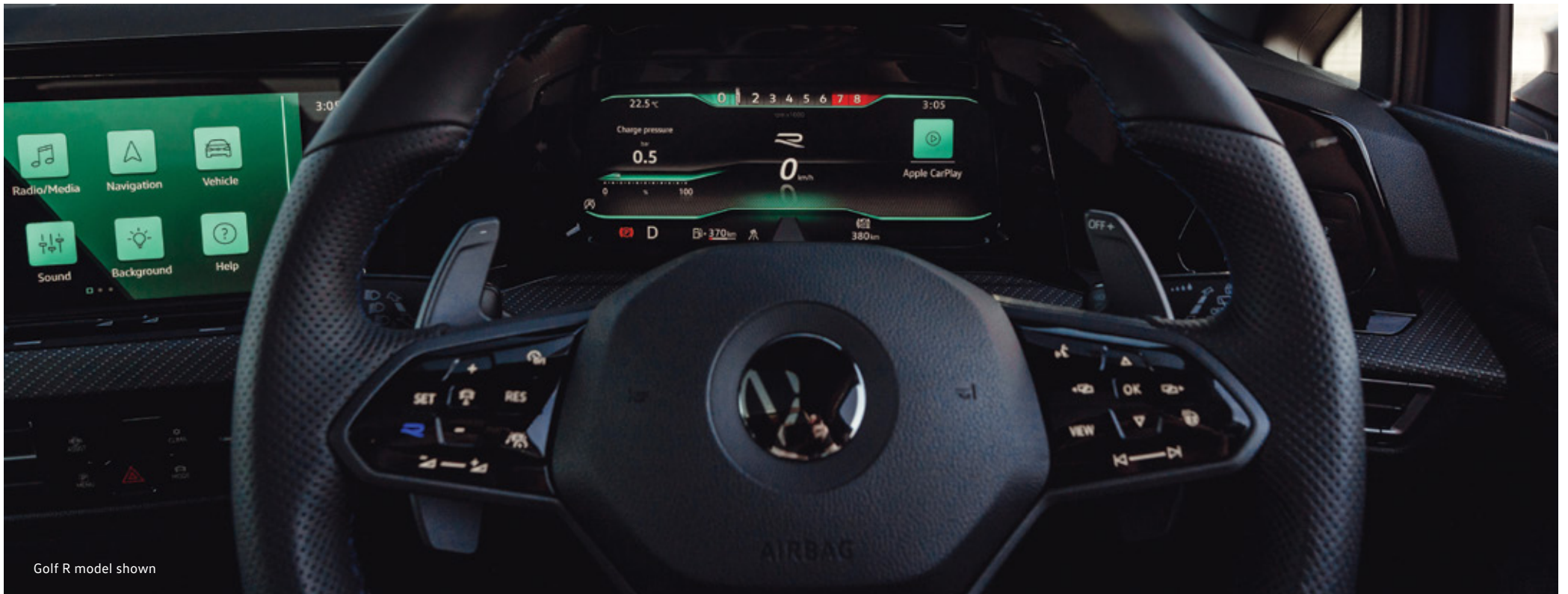
Golf R model shown