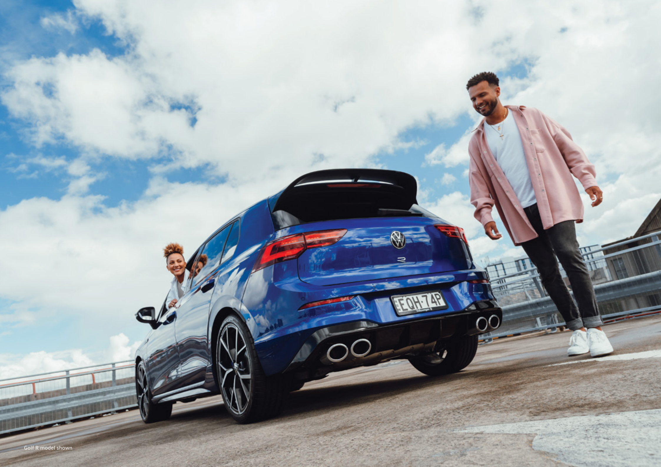
Golf R model shown