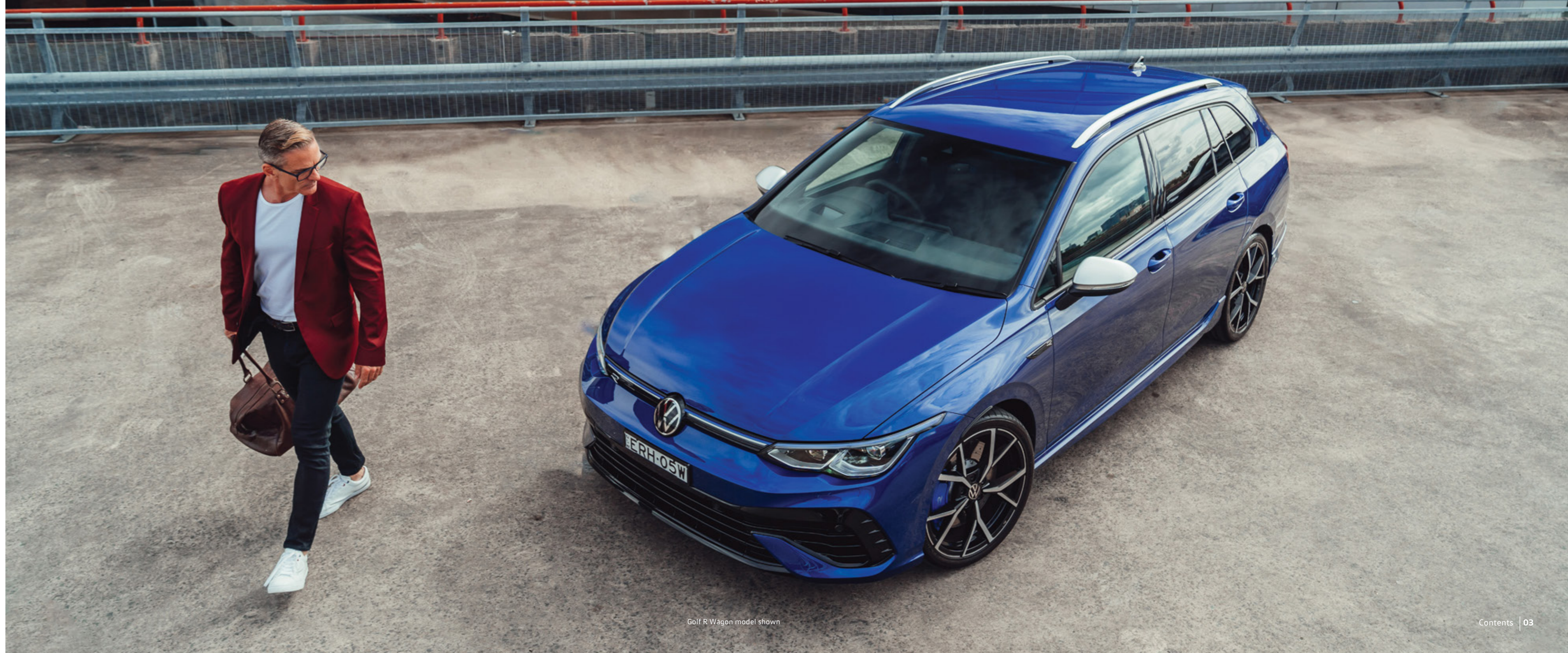
Golf R Wagon model shown