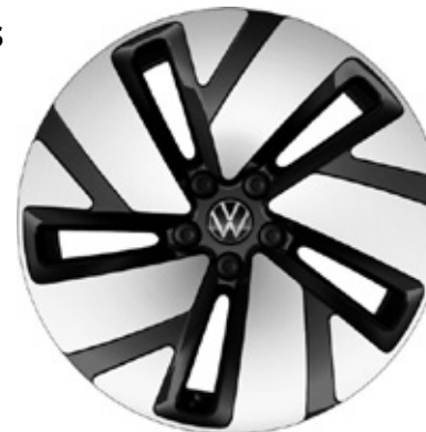
19" alloy wheel - Tilburg

8 J x 19 front, 9 J x 19 rear, black, diamond-turned finish | P |