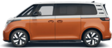
Candy White/Energetic Orange