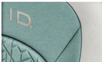
SEAQUAL® seat upholstery in Jade Green-Mistral | P |