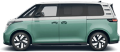
Candy White/Bay Leaf Green