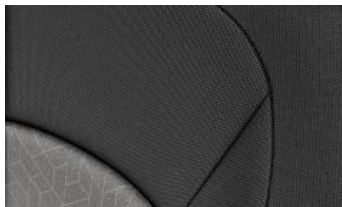
Cloth seat upholstery in Palladium-Soul | P |