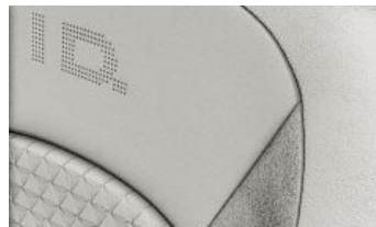
ArtVelours ECO seat upholstery in Mistral | P |