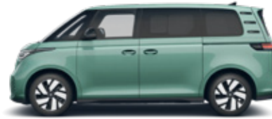
Bay Leaf Green