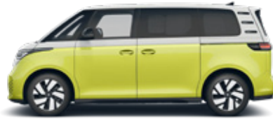
Candy White/Pomelo Yellow