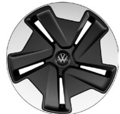
20" alloy wheel - Bromberg

8 J x 19 front, 9 J x 19 rear, black, diamond-turned finish | P |