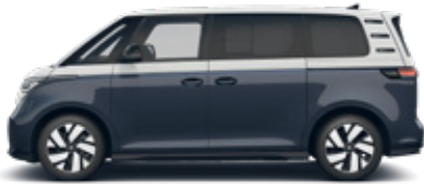
Candy White/Starlight Blue