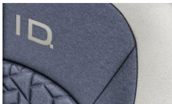
SEAQUAL® seat upholstery in X-Blue-Mistral | P |