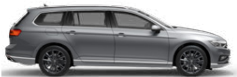
Pyrite Silver Metallic