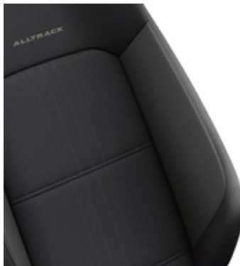
Passat Alltrack - Titan Black Cloth