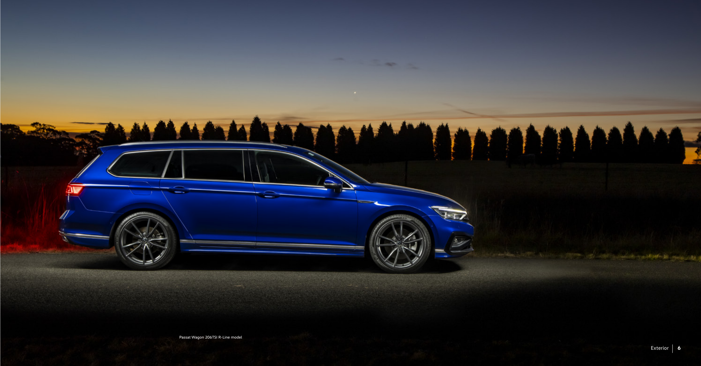
Passat Wagon 206TSI R-Line model