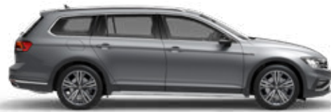
Pyrite Silver Metallic