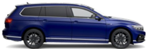
Lapiz Blue Premium Metallic*