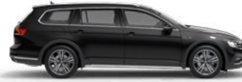
Manganese Grey Metallic