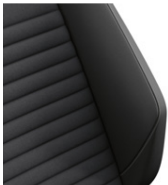
Passat Elegance - Titan Black Nappa Leather appointed#