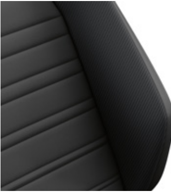
R-Line Black Nappa (Optional) Leather appointed#