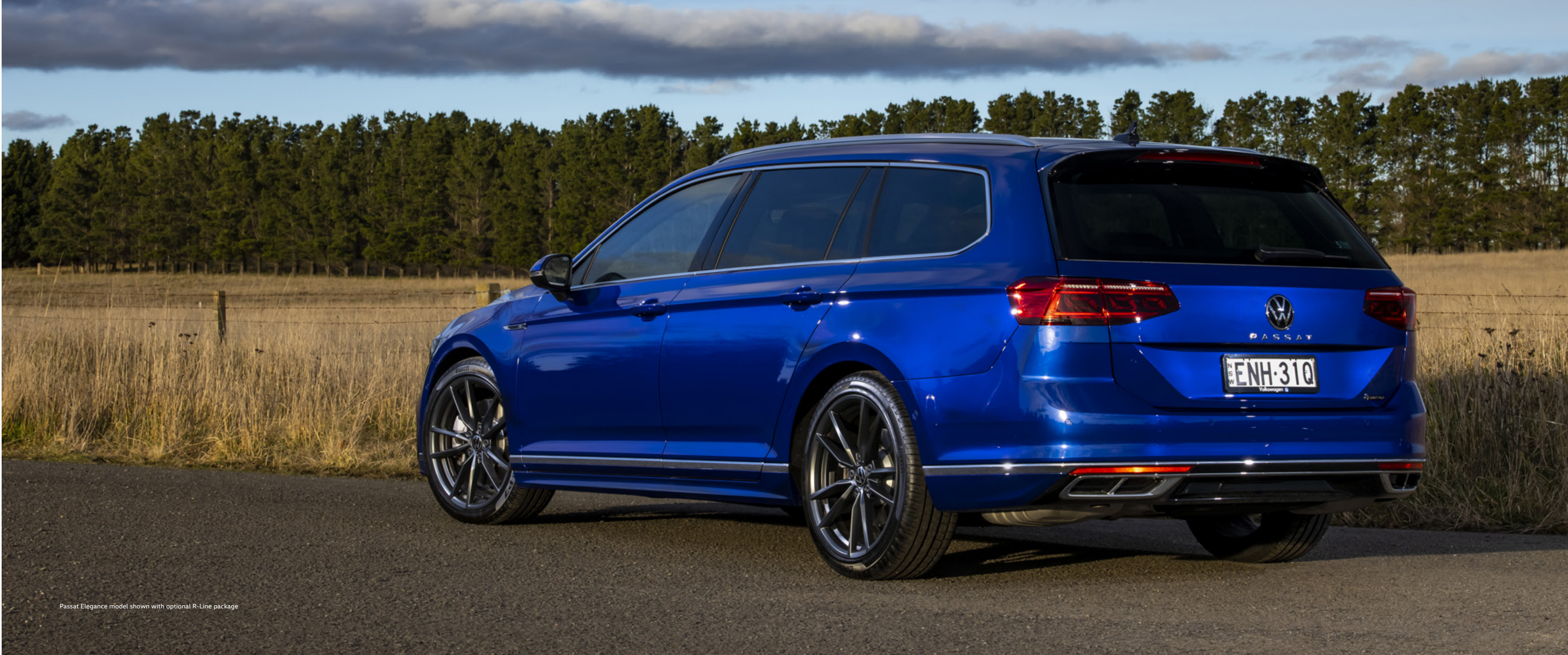
Passat Elegance model shown with optional R-Line package