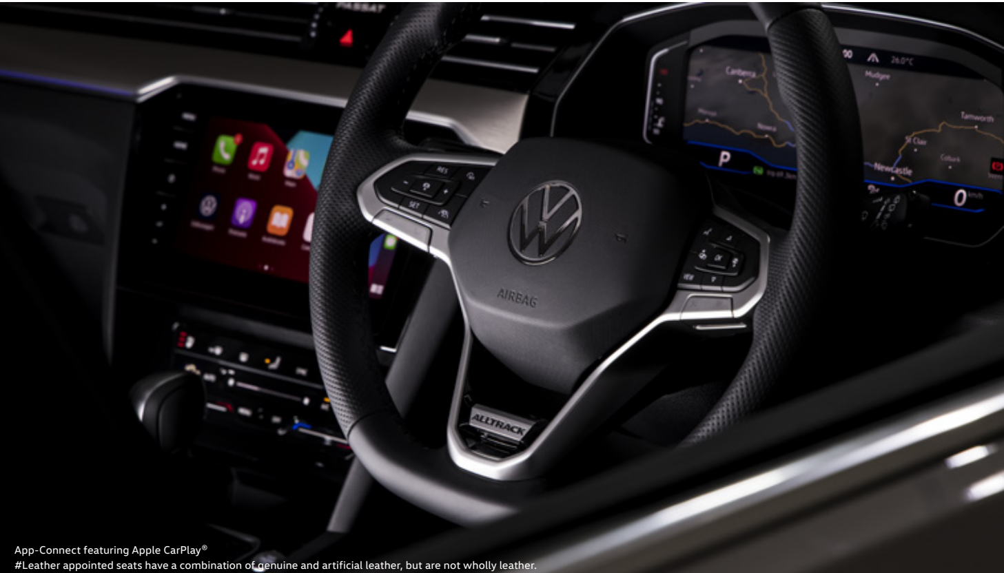
App-Connect featuring Apple CarPlay® #Leather appointed seats have a combination of genuine and artificial leather, but are not wholly leather.

If the Passat's assured and smooth character wasn't already apparent in its exterior styling, a glance at the vehicle's luxurious interior appointments will readily convince even the most discerning driver. The Passat's cabin offers superior aesthetics and cool sophistication, but never at the expense of comfort or practicality. Easy entry and seat memory function in the Passat range (and Alltrack 162TSI Premium) make it easy to access the vehicle and find a comfortable driving position. Air Care 3-zone climate control with rear controls make it a cinch to maintain optimal temperature conditions. The 162TSI Elegance adds an extra level of refinement with ambient interior lighting and Nappa leather# appointed seat trim. 'Dayton Brush' brushed aluminium inserts for the dashboard and door add a distinctive touch, while the Panoramic glass sunroof allows for a gloriously light-filled cabin. R-Line styling cues in the optional R-Line package (Elegance variant only) bring an undeniably sporty edge to the Passat's cabin. Features such as R-Line scuff plates in door apertures, R-Line decorative inserts in brushed silver, brushed stainless steel pedals and an alluring R-Line multi-function sports steering with wheel paddles, will make you the envy of your friends.