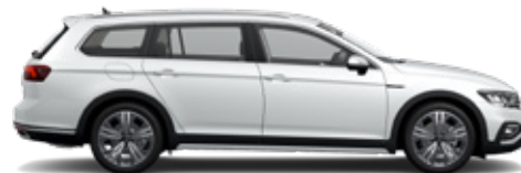
Glacier White Metallic