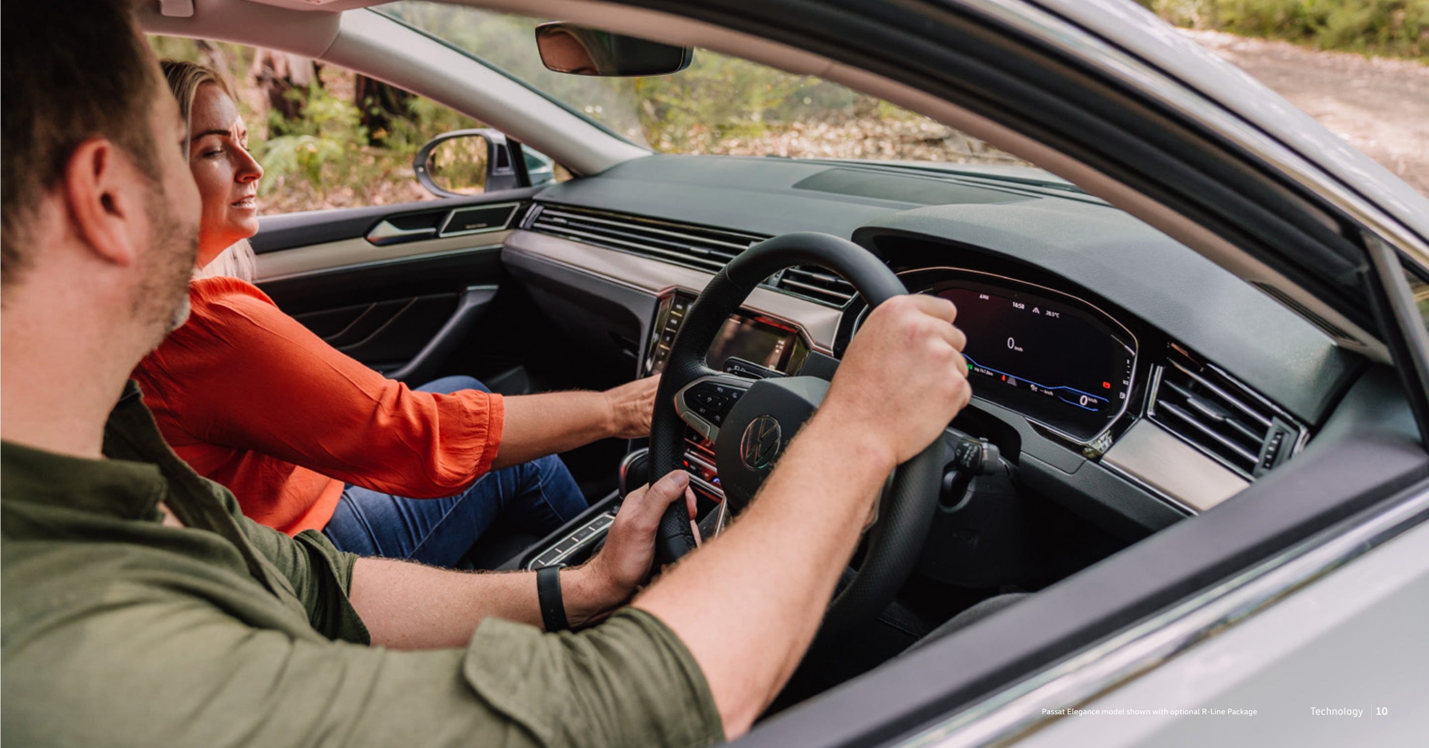
Passat Elegance model shown with optional R-Line Package

*Safety technologies are designed to assist the driver, but should not be used as a substitute for safe driving practices. ~App-Connect featuring wireless Apple CarPlay® and wireless Android Auto™ is compatible with the latest versions of iOS and Android, active data service required, optional connection cable (sold separately).