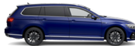
Lapiz Blue Premium Metallic*