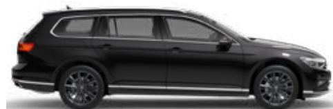
Manganese Grey Metallic