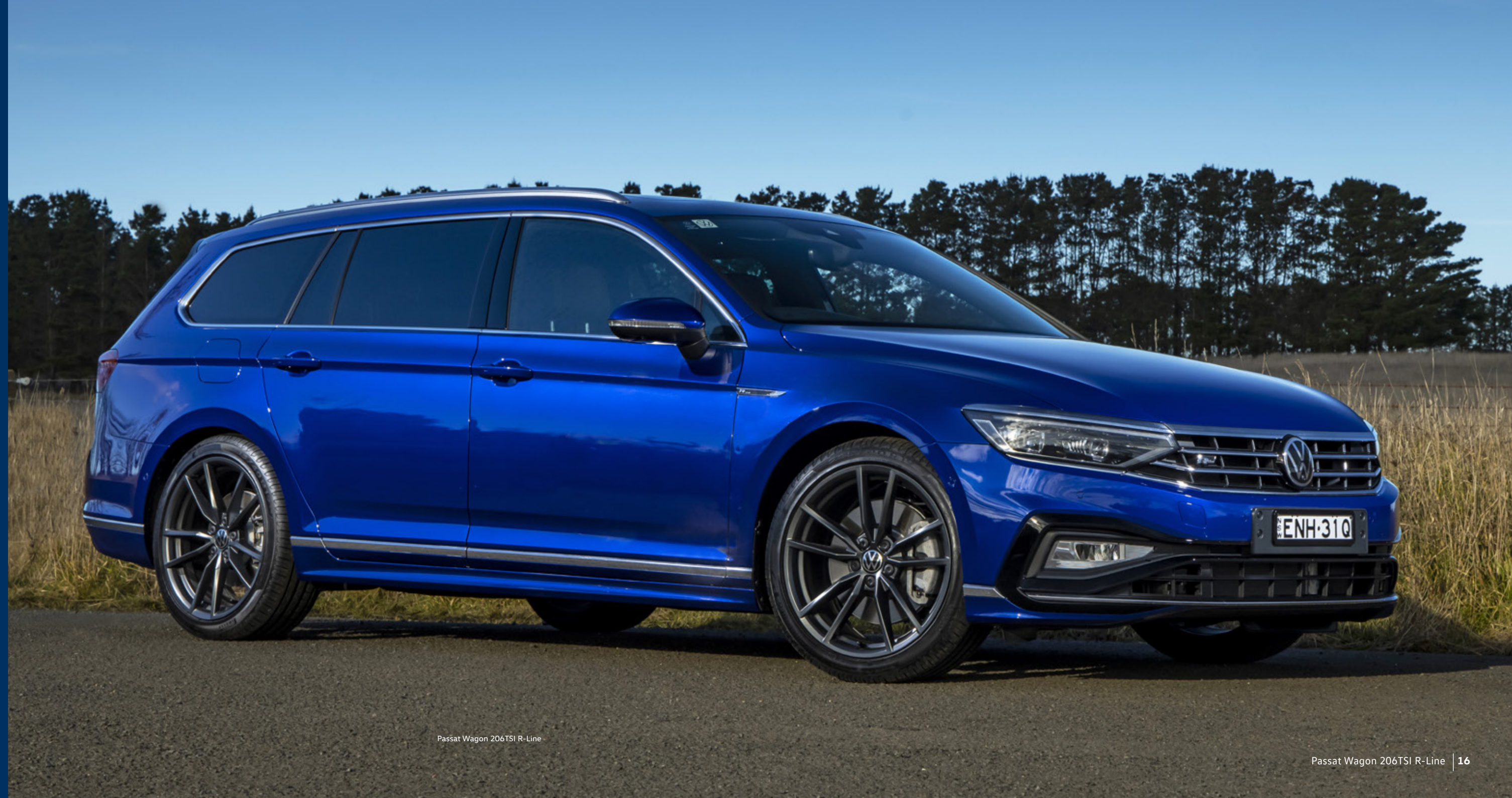
Passat Wagon 206TSI R-Line

Proving that the Passat Wagon 206TSI R-Line never forsakes comfort for pure driving performance are additional conveniences designed to pamper and surprise. Heated and electric front seats with driver massage are the epitome of comfort, while easy entry and memory function makes it easy to find a supported seating position. For the perfect mood-setter, the Passat Wagon 206TSI R-Line also allows you to choose from among 30 ambient interior light colours.