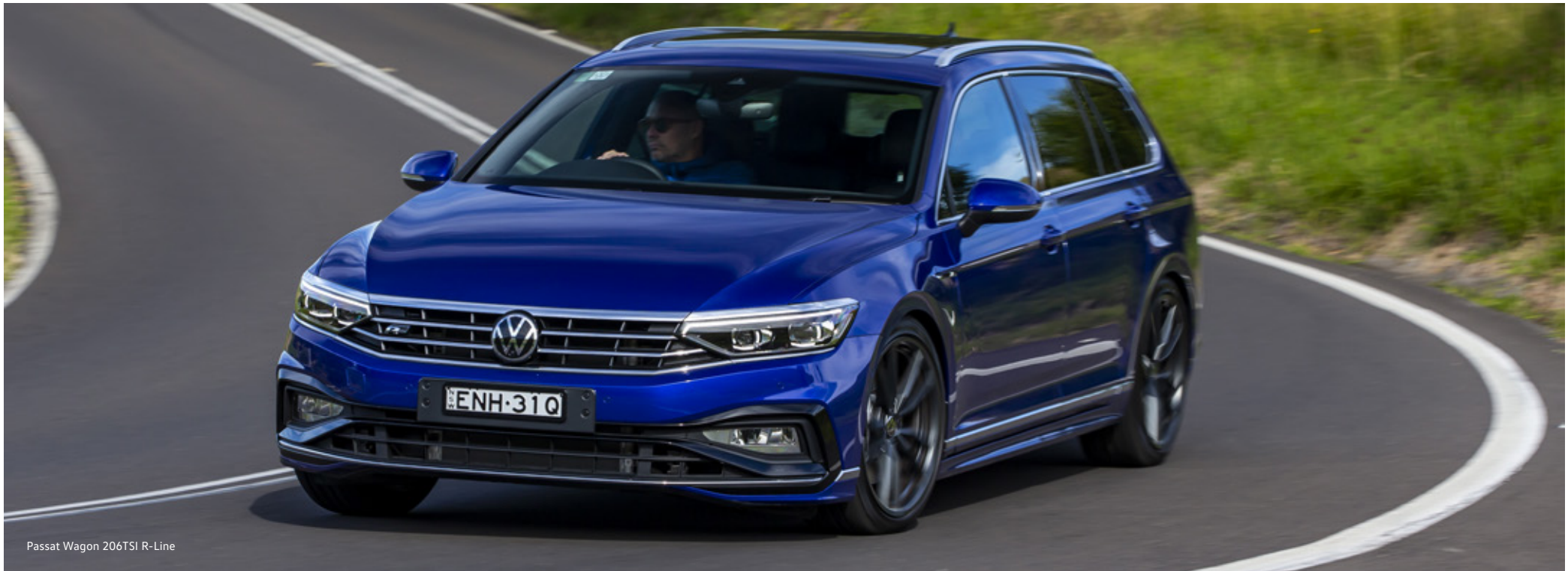
Passat Wagon 206TSI R-Line