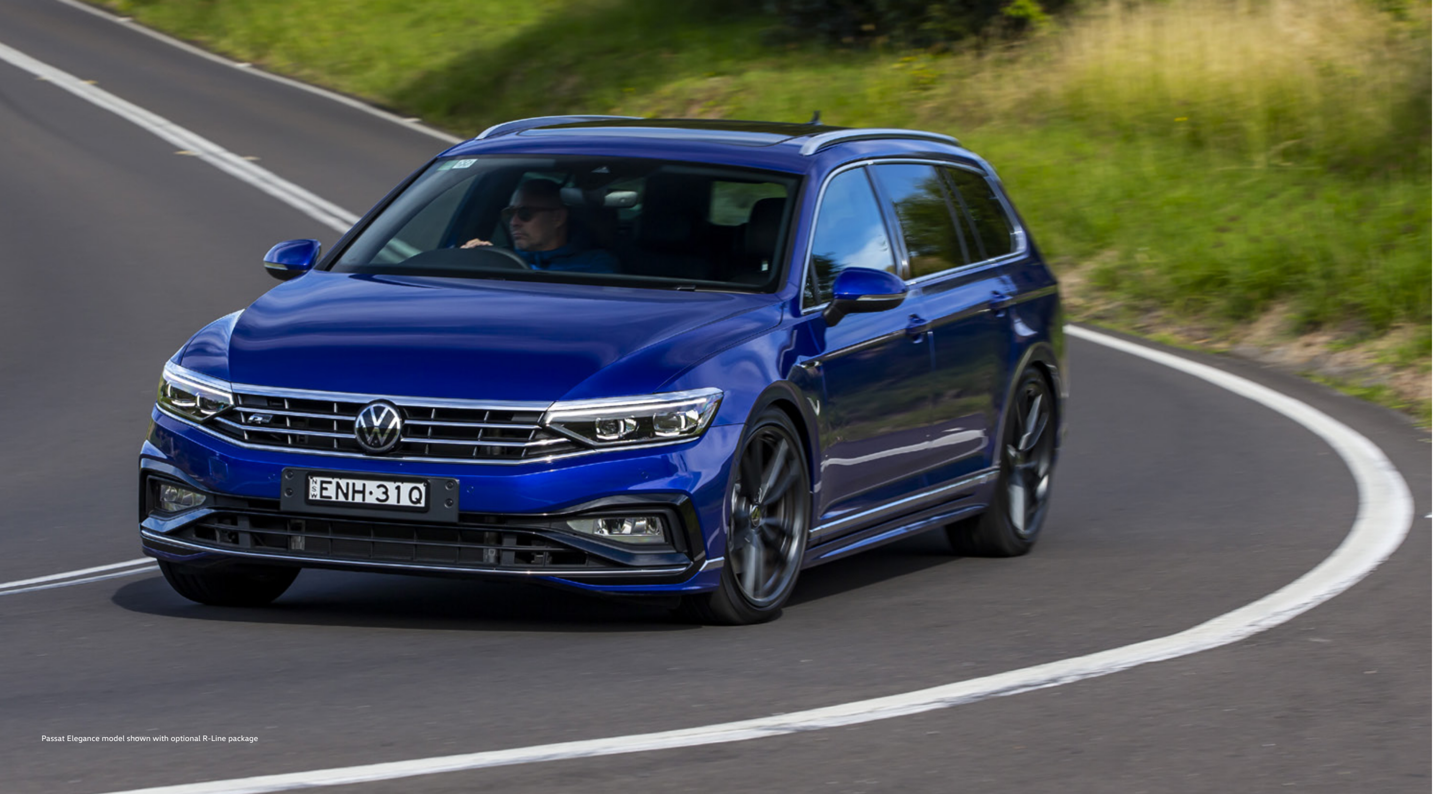
Passat Elegance model shown with optional R-Line package