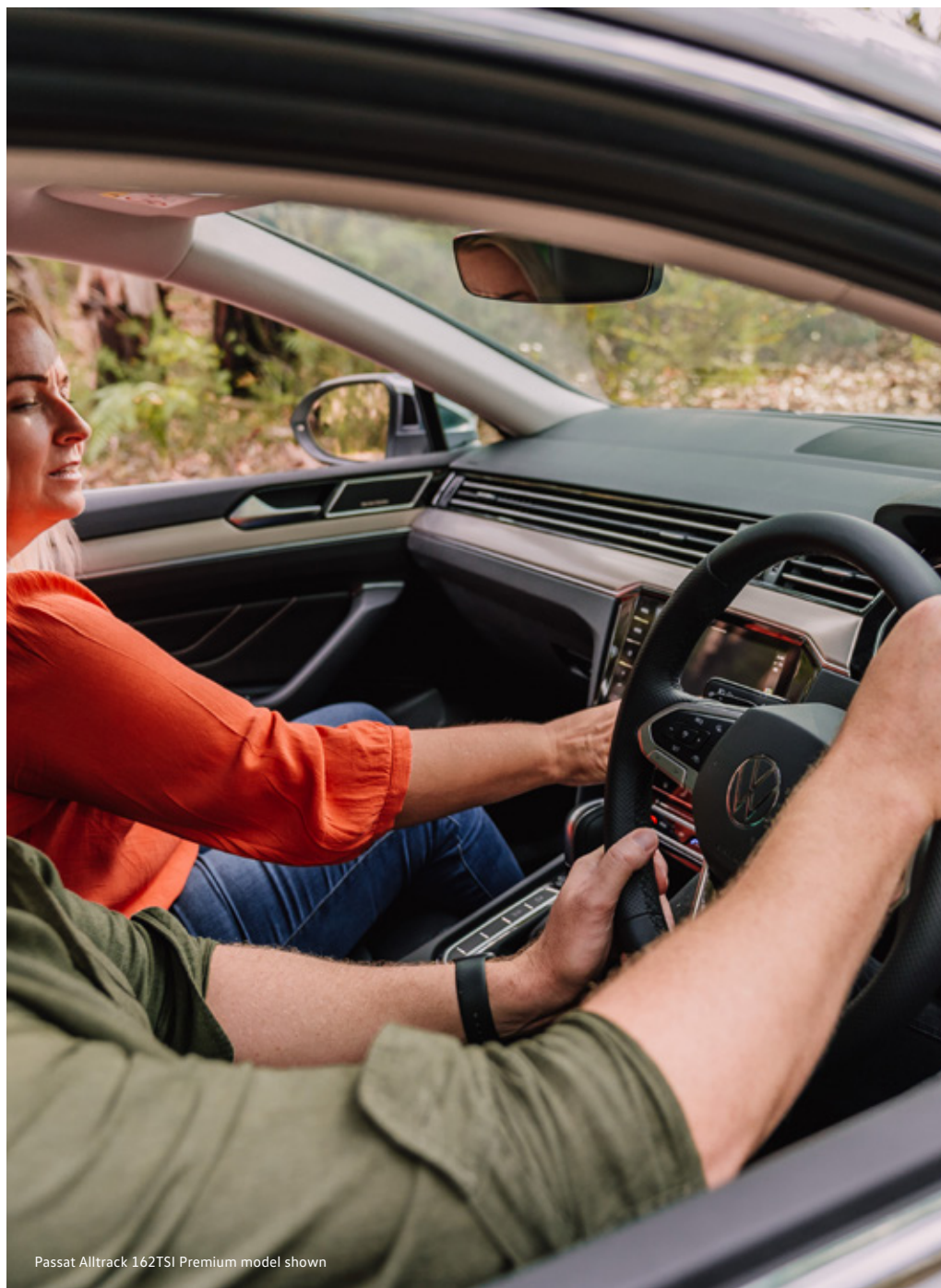
Passat Alltrack 162TSI Premium model shown

S Standard O Optional Extra P Available as part of an optional package — Not available