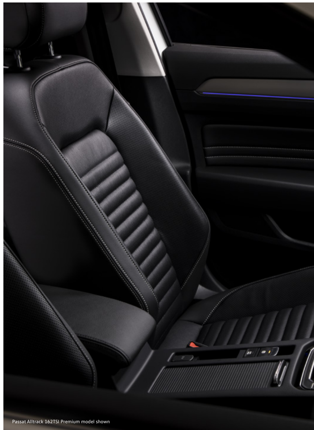
Passat Alltrack 162TSI Premium model shown