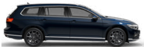
Aquamarine Blue Premium Metallic