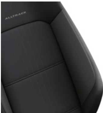
Passat Alltrack - Titan Black Cloth