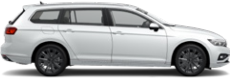
Glacier White Metallic