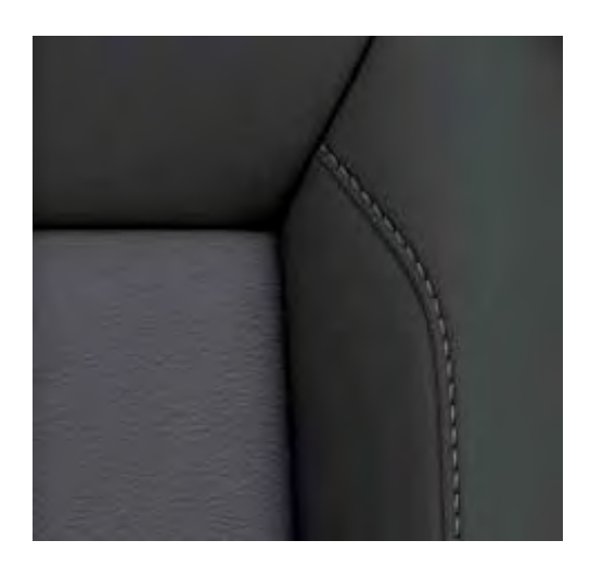
Grey-Black Vienna leather appointed seat upholstery

Leather appointed seats have a combination of genuine and artificial leather, but are not wholly leather.