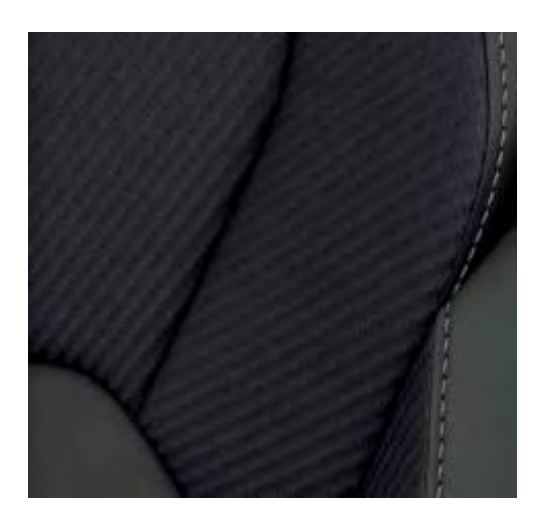
Black Nappa leather appointed seat upholstery