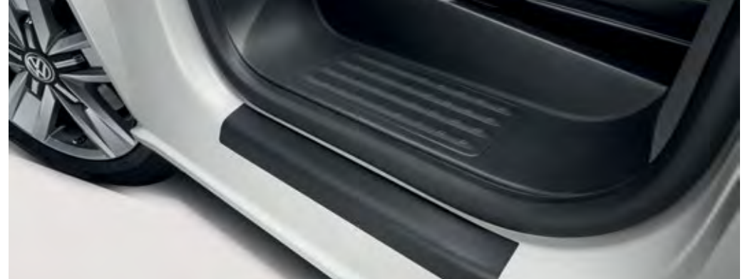
11 Door sill protection film