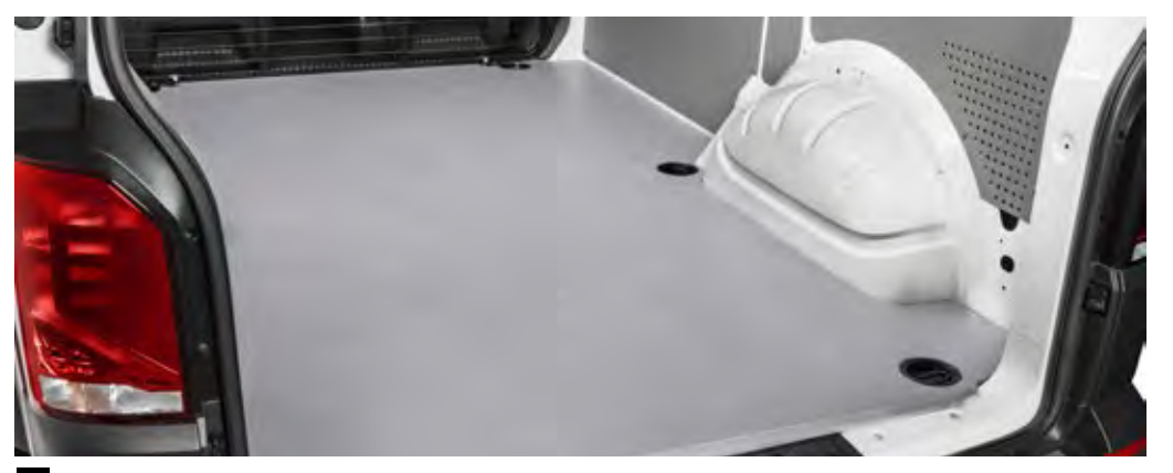
06 Wooden floor