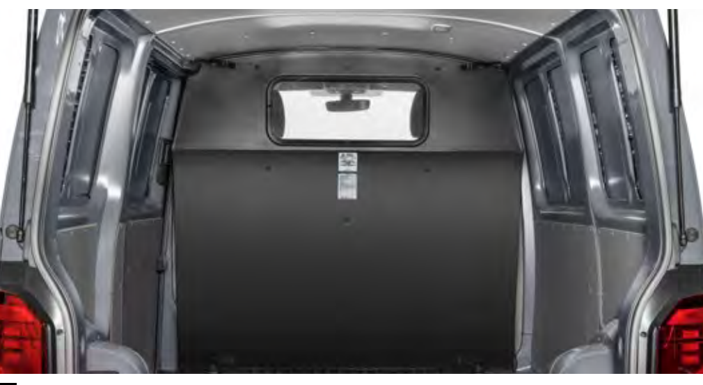
04 Partition vapour barrier