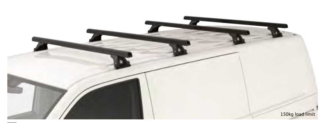
01 Commercial roof bars (available in 3 or 4 bar system)

Volkswagen Genuine Accessories ensures your Transporter remains 100% Volkswagen. The extensive range of Transporter accessories provides you the opportunity to adapt your Transporter even more precisely to your individual needs.