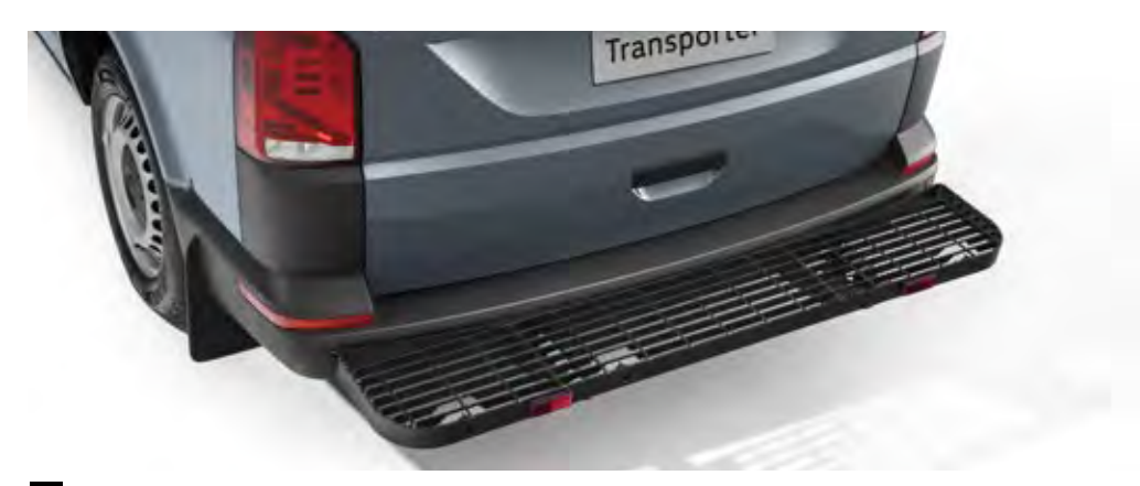
07 Rear technician step (to suit with and without towbar)