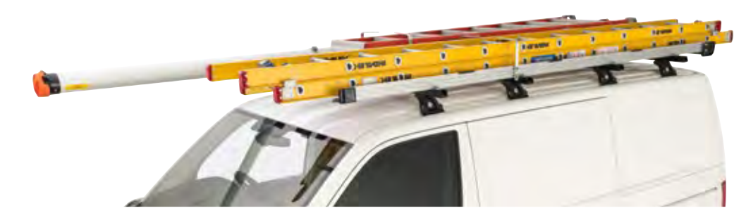
03 Full Technician Kit (includes 3 cross bars, ladder holders, conduit holder)