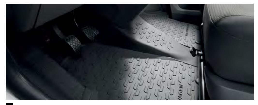
10 Heavy duty rubber floors mats set