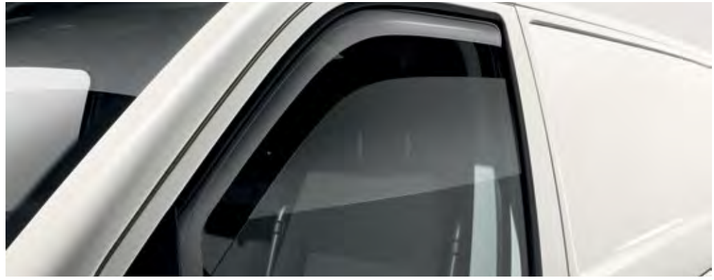
09 Slimline Weathershields