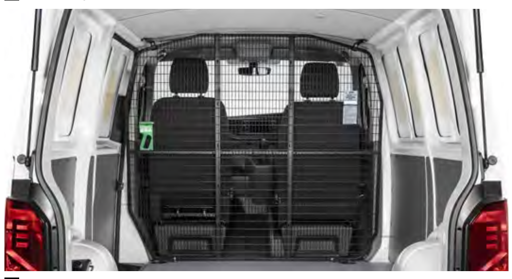
05 Cargo barrier