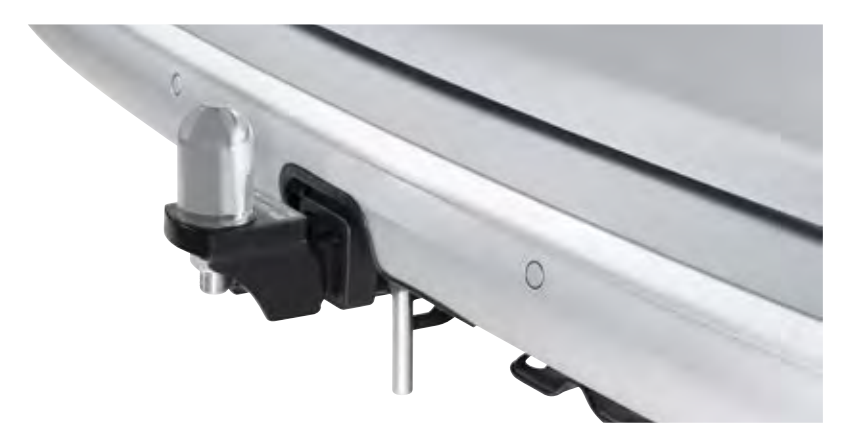
08 Towbar kit