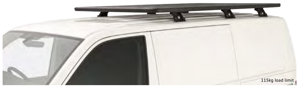
02 Platform system