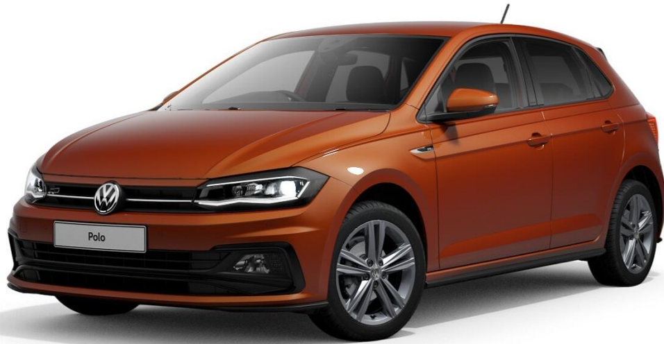
TSI R-Line DSG shown