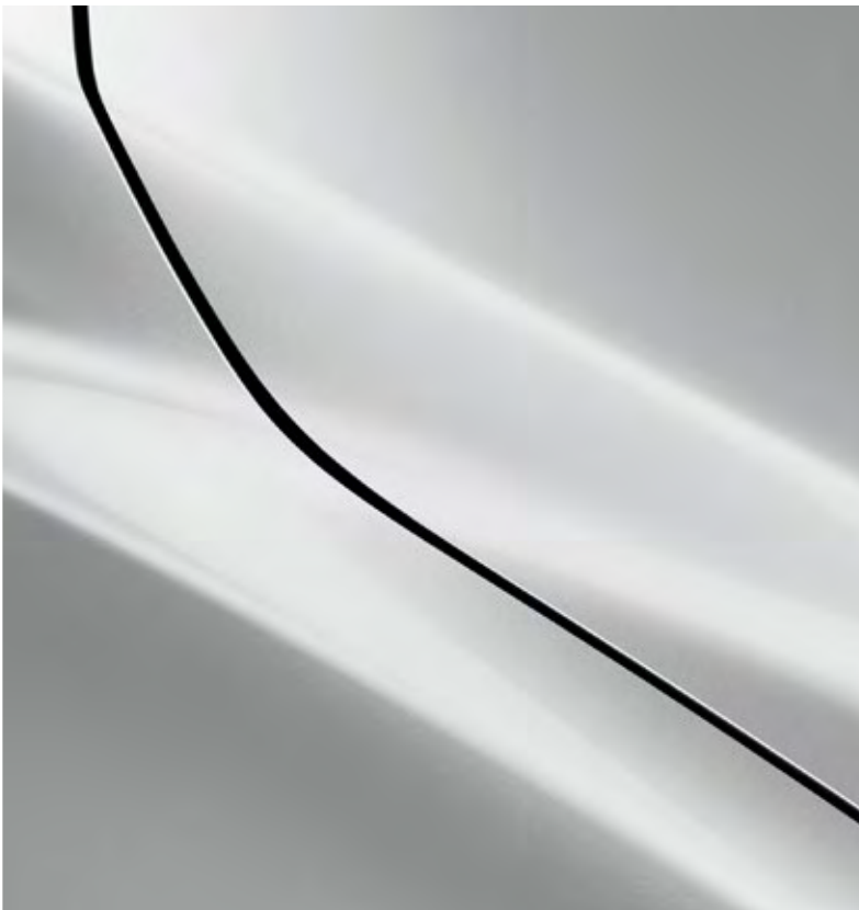
Sonic Silver Metallic