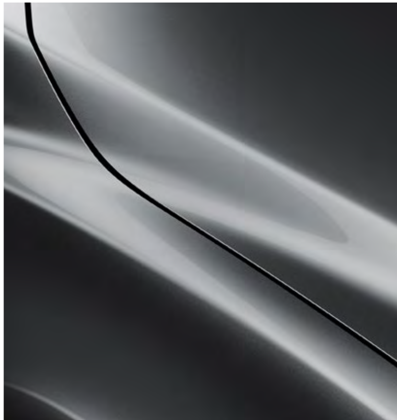
Machine Grey Metallic^

Fusing the hard appearance of metal with a glossy smoothness, Polymetal Grey Metallic comes exclusive to the hatch and changes colour depending on the light, accentuating beautiful lines of bodywork.