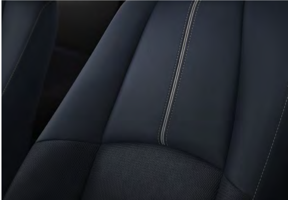
Navy blue/black cloth (G15 Evolve)