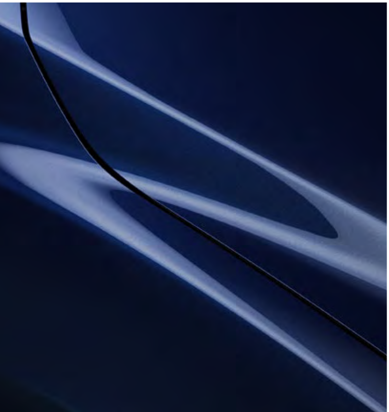
Deep Crystal Blue Mica^+