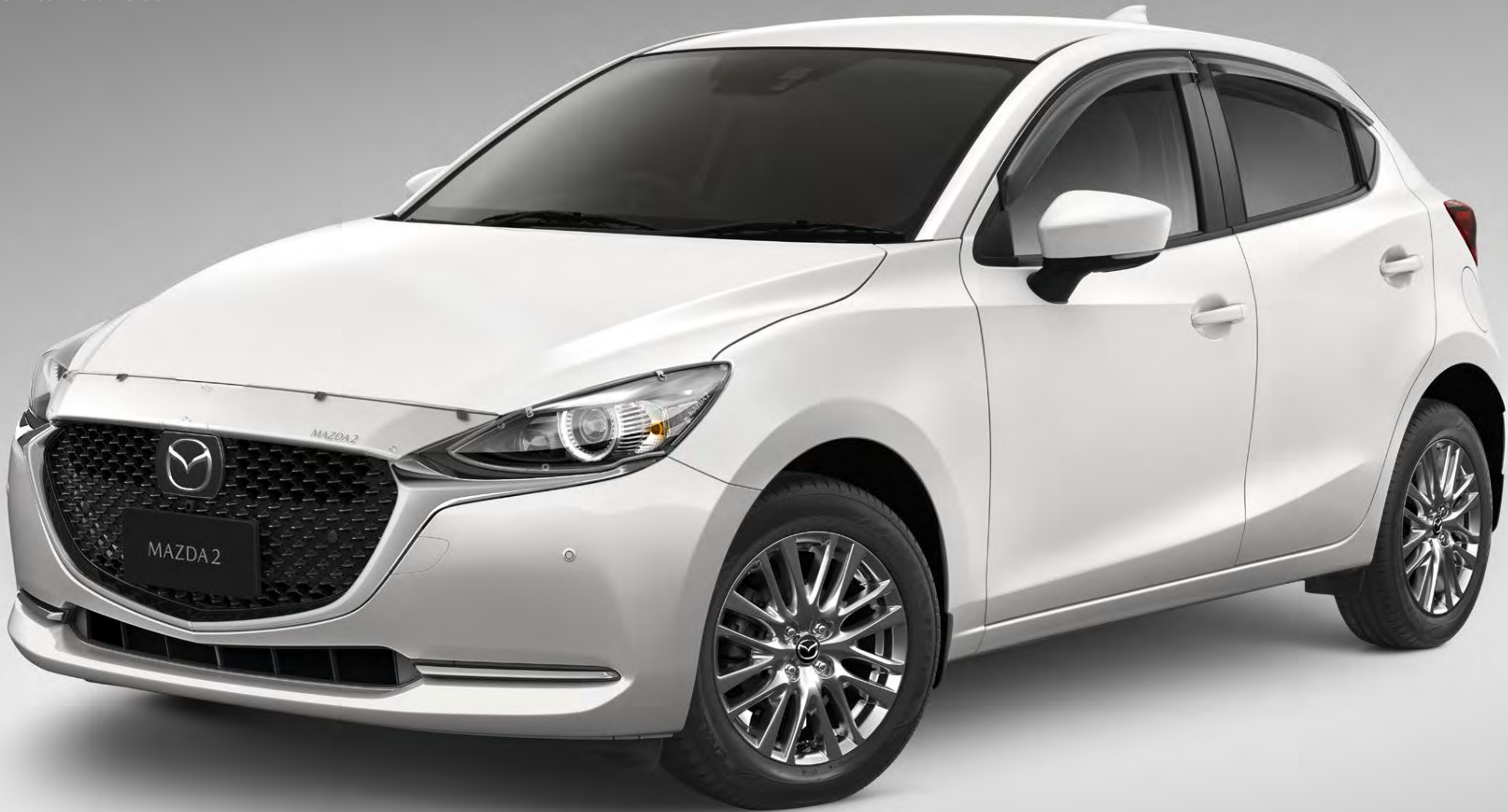
Mazda2 G15 GT in Snowflake White Pearl Mica.

Welcome to the benchmark of small car style and sophistication. It's time to step up to Mazda2. Add Mazda Genuine Accessories, and the experience becomes even more special.