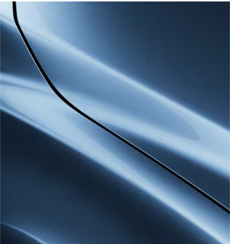
Eternal Blue Mica