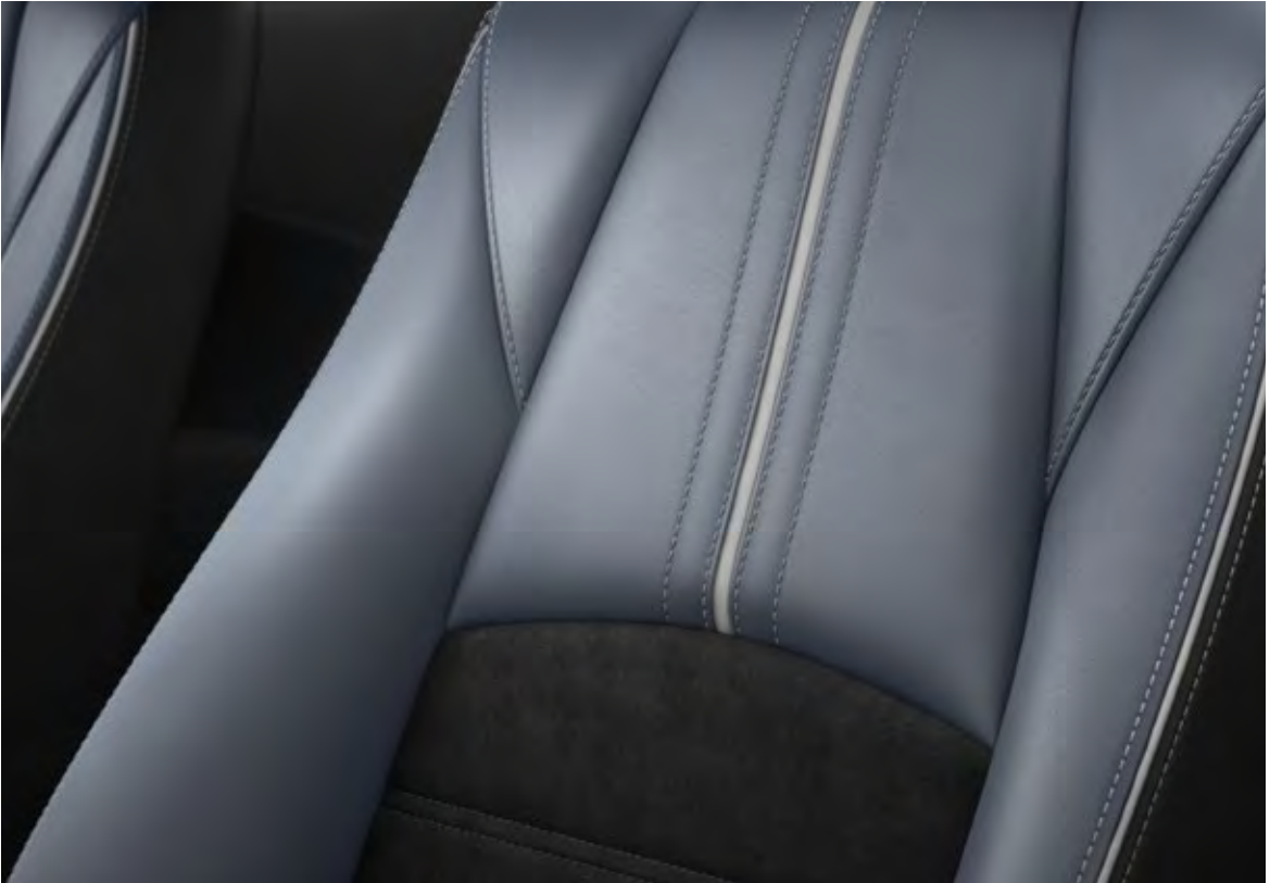
Blue grey leather# with grey Grand Luxe ® ^ synthetic suede (G15 GT)