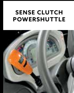
SENSE CLUTCH POWERSHUTTLE