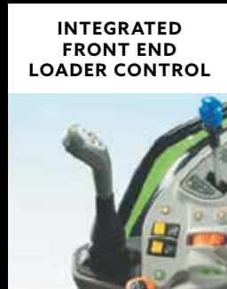
INTEGRATED FRONT END LOADER CONTROL