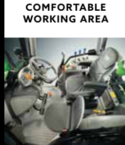
COMFORTABLE WORKING AREA