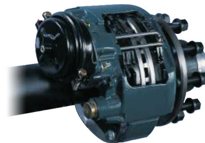
Shown with WABCO PAN19-1 Caliper