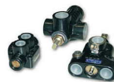
Diverter and End-Of-Stroke Valves.