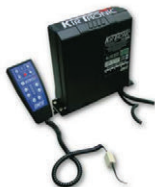
KIPTRONIC EV02 management system for tipper.