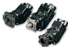
Bent Axis Piston Pumps Series HDS and MDS.