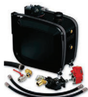
Wet kits for Heavy Duty trucks.