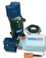
S.A. power pack complete.