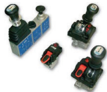
Pneumatic switches and cab controls.