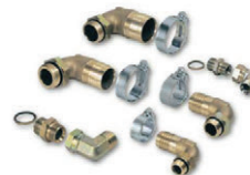
45° and 90° delivery and suction fitting kits series GOLD.