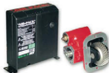
PTO pneumatic control with AIR-PACK compressor.