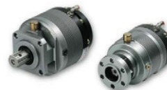
Three and four bolt SLICK SHIFT Clutch Units.