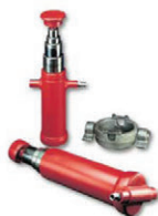
Single acting underbody cylinders.