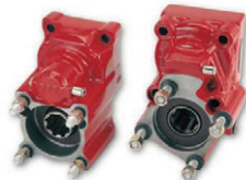
Universal PTO's series POWERFULL and POWERTRUCK - Heavy Duty