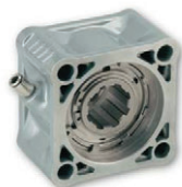
Universal coaxial back PTO type POWER-LIGHT.