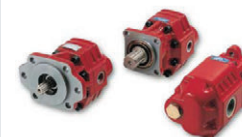
Self-Balanced gear pumps type NPH.