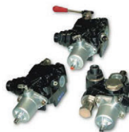
3-Position Tipping Valves from 45 to 250 lpm.