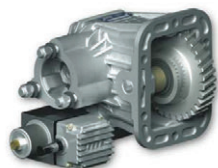
PTO with electromagnetic shift MAG-TRONIC system.