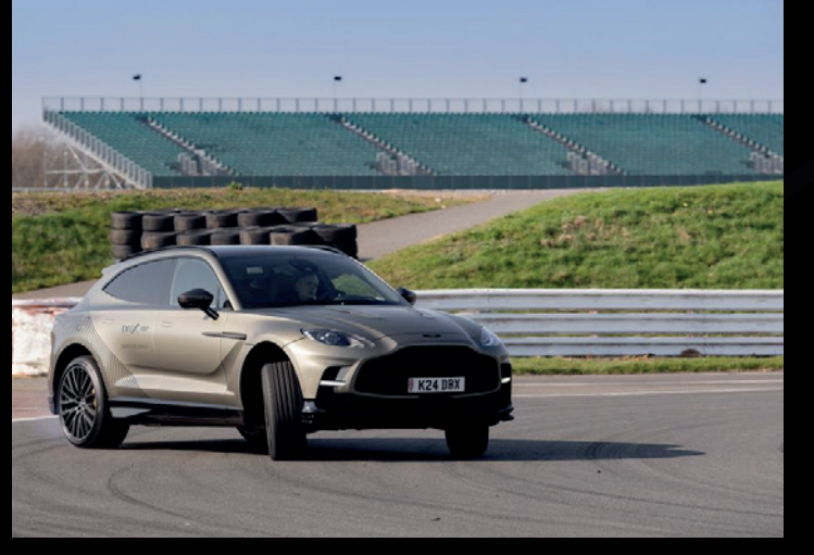
2022 Aston Martin DBX707 Prototype Drive: The New SUV King?